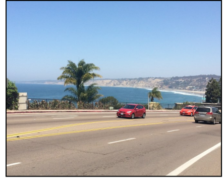
Torrey Pines Road is a smoother ride because potholes that developed after the storms have been filled.

You may also contact city departments directly using the contact information provided in the blue box below.