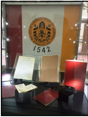
The City's original Charter on display as part of the City's historical collection.

At its Feb. 3 meeting, the Committee considered the Junior Lifeguards and San Diego High School's requests dealing with the use of parklands. The Committee requested that city staff work with the Junior Lifeguards to build a Mission Bay headquarters. The committee also had concerns about San Diego High School's request for an exception to the prohibition of educational facilities