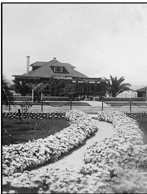
La Jolla's historical buildings give the community a unique charm.

To celebrate the 50th Anniversary of the National Historic Preservation Act, the La Jolla Historical Society will be hosting La Jolla Landmarks Week featuring a series of events that encourage preservation in La Jolla. This year's events include: