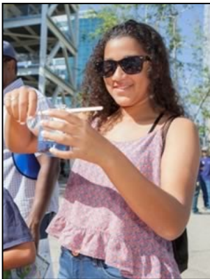
The Festival of Science and Engineering on March 5 will feature hands on and interactive displays for attendees of all ages.

The 2016 Festival of Science and Engineering kicks off on Saturday, March 5 with EXPO Day at Petco Park from 10:00am-5:00pm . All are welcome to attend this free family-friendly event.