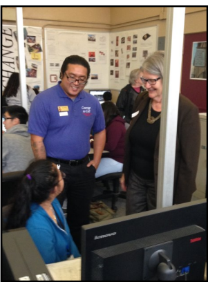
The Bridges to Education program gives students real-world STEM projects.