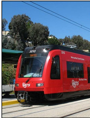
The Mid-Coast Trolley Project will bring trolley service to University City.

The Mid-Coast Trolley will extend light rail service from the Santa Fe Depot in Downtown San Diego to the University City community, serving major activity centers such as Old Town, UC San Diego, and Westfield UTC. Its service is anticipated to begin in 2021.