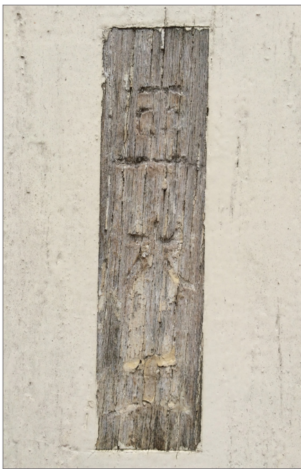
Chinese characters carved into a door of the Derby-Pendleton House’s adobe wing provide a glimpse of the diversity of Old Town’s early residents.

In the post-Civil War years, freemen and Blacks recently freed from slavery increasingly came to San Diego for the same reasons others did: to start a new life, to find economic gain, and, although not always realized, to experience the supposed freedom offered by the western frontier. The alleged openness of the West and of the frontier may have been overstated by noted historian Frederick Jackson Turner, but in relative terms, the west offered a modicum of freedom and opportunity when compared to the South. As a result, Black settlers and émigrés in this period came largely from the South and settled throughout San Diego County. It has been