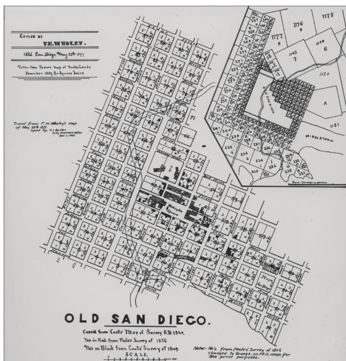
Couts Survey map of Old Town, 1849.

In 1850, California officially became part of the United States and San Diego County was formally organized. At that time, the San Diego County census records only eight African-Americans in a total population of 798 individuals. This almost certainly represents an under reporting given