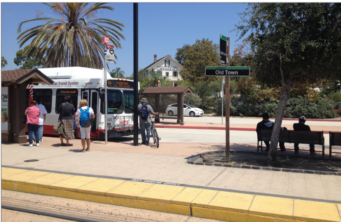
The Old Town Transit Center provides convenient access to Old Town State Historic Park (in background) and other regional destinations.

In 1996, the Old Town Transit Center was established between Pacific Highway, Congress Street and Taylor Street and led to the realignment of Congress Street. Since its construction, the Transit Center has brought many visitors and transit-riders to the Old Town community.