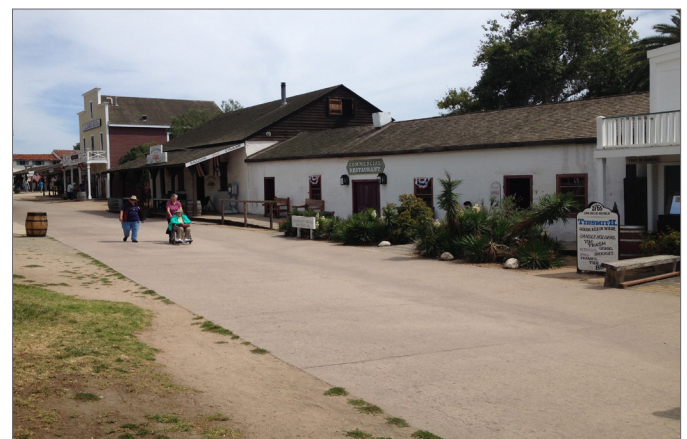
Old Town State Historic Park preserves historic structures from early San Diego and recreates the atmosphere of the town from the period of 1821 to 1872.

Also in 1966, the City established the Old Town San Diego Community Planning Group to work with City staff to prepare a Community Plan to provide a long-term vision to restore Old Town's historical character. The City adopted the Old Town San Diego Community Plan in 1968, which proposed the creation of the State Historic Park.