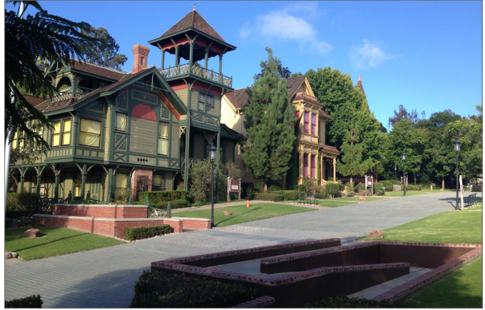
Heritage Park on Juan Street preserves excellent examples of Victorian architecture from various neighborhoods in San Diego.

The Program Environmental Impact Report (PEIR) provides a programmatic assessment of potential impacts that could occur with the implementation of the Community Plan, in accordance with the California Environmental Quality Act (CEQA). The City will determine whether potential impacts of proposed development or improvement projects were anticipated in the Community Plan PEIR analysis or whether the project will require additional environmental review. Projects consistent with the Community Plan PEIR may not need further environmental review.