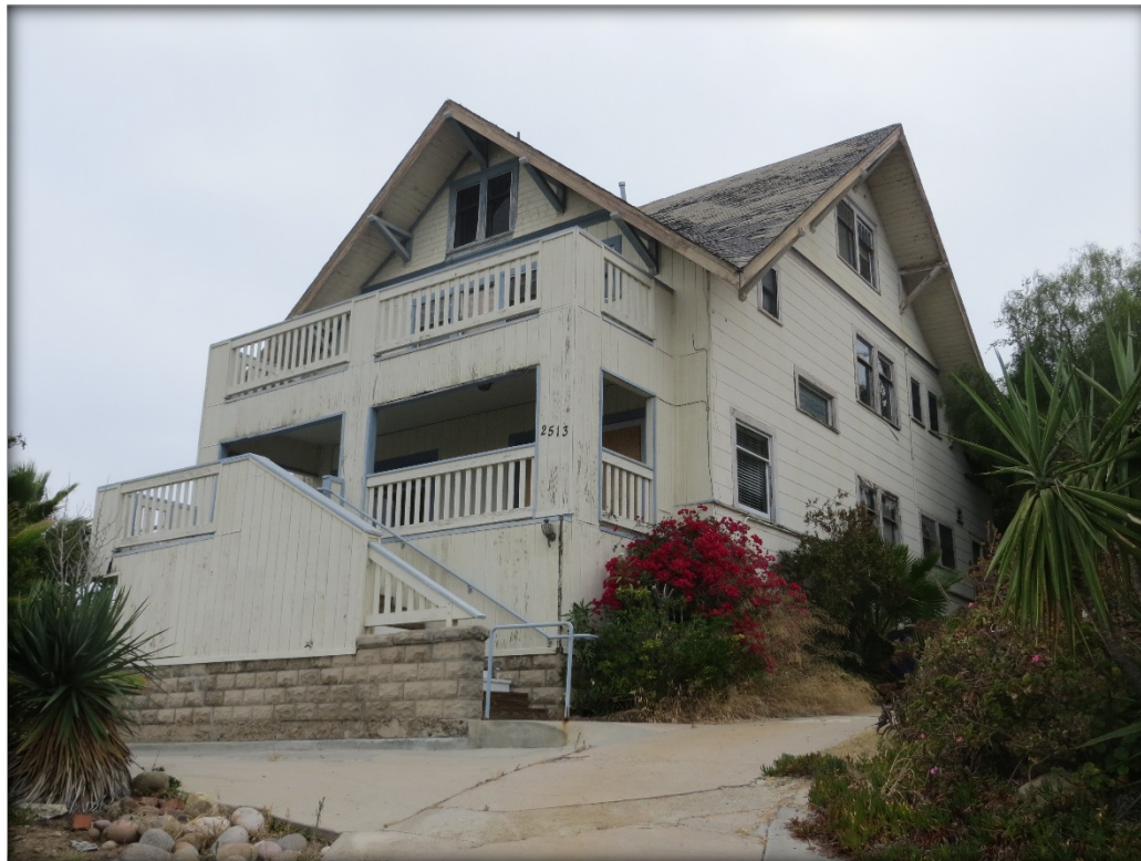
2513-2515 Union Street