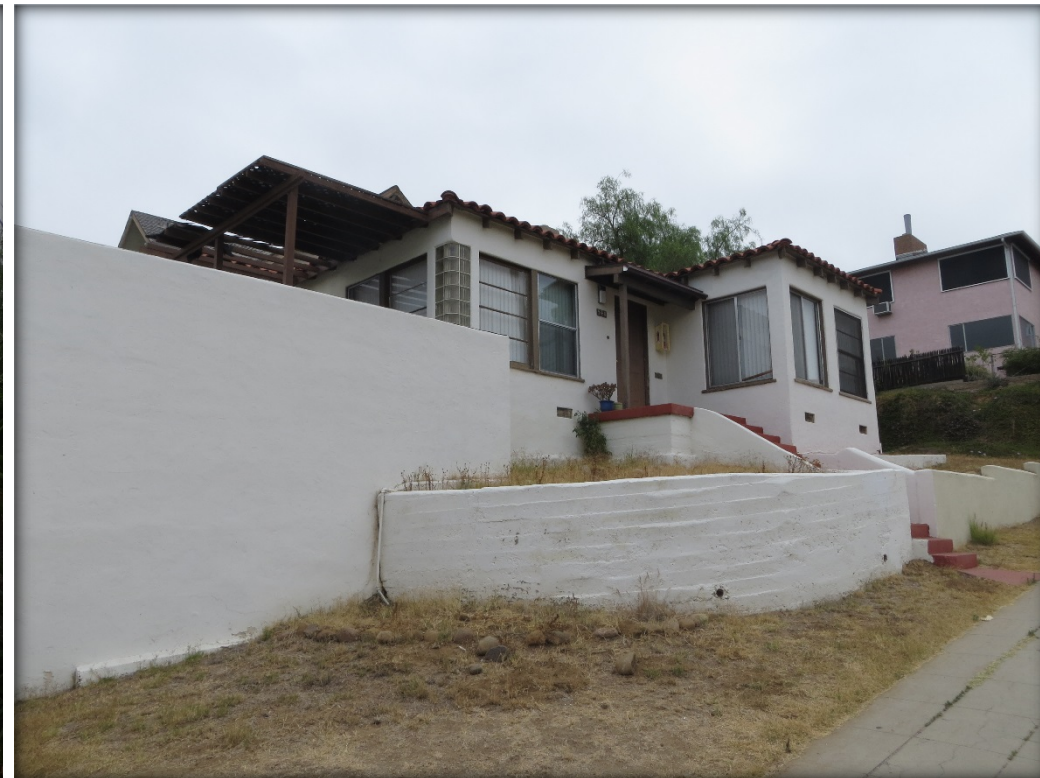
540 West Laurel Street