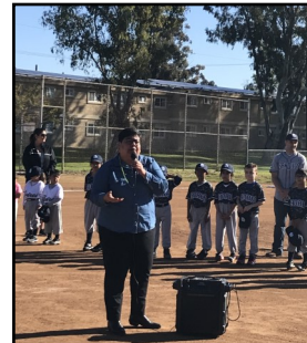
Southeastern Little League Opening Day