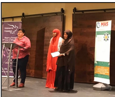
Community Forum on Domestic Violence