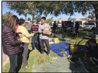
Rolando Community Council Succulent Swap