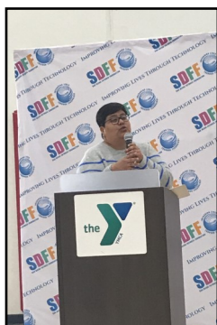
STEMFEST: Inspiring youth to study math and science