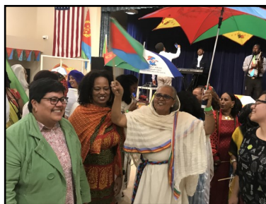
National Association of Eritrean Women, San Diego Chapter