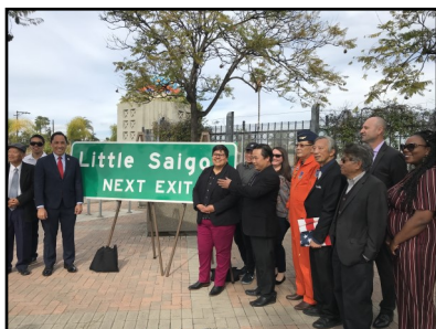
Little Saigon Freeway Signs on I-15