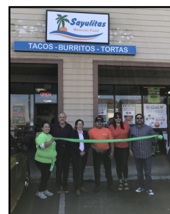
Sayulita's Mexican Food Grand Opening, - Southcrest