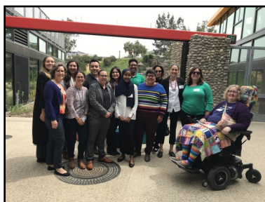
Ocean Discovery Institute—City Heights