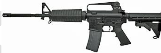
Olympic Arms 5.56 AR-15 (pictured above)

Manufacturer Description: No manufacturer description.