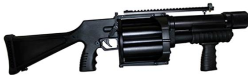
Penn Arms – Model PGL 65-40 (pictured above)

Manufacturer Description: A 40mm pump-action advance magazine drum launcher with a fixed stock and combo rail. It has a six-shot capacity and rifled barrel. Features include: Double-action trigger, trigger lock push button and hammer lock safeties.