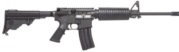
DPMS 5.56 AR-15 (pictured above)

Manufacturer Description: No manufacturer description.