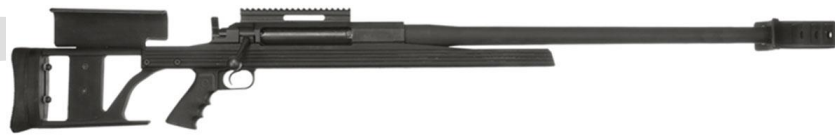
Armalite AR-50 (pictured above)

Manufacturer Description: This rifle is the newest incarnation of the wildly popular AR-50 chambered for the powerful .50 BMG cartridge – a single-shot, bolt-action rifle featuring a unique octagonal receiver bedded down into a V-shaped stock. Designed to be an economical answer for the challenges of long range shooting, the AR-50A1 is amazingly accurate and with its massive muzzle brake, it has a very manageable recoil. The AR-50A1 is a highly refined rifle which is a stark and refreshing difference that maintains its superiority over the competition. The buttstock is removable, allowing for increased portability when traveling. Includes the extremely rugged and versatile GG&G bipod.