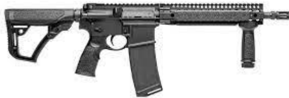
Daniel Defense DDM4 V4SBR (pictured above)

Manufacturer Description: The DDM4 V4S AR15 style firearm is based on a configuration that we've been providing to law enforcement as well as civilian users who demand a lightweight, durable, and dependable short barreled rifle (SBR). Built around a free-floating, Cold Hammer Forged 11.5 inch barrel, the V4 S delivers optimal maneuverability, reliability, accuracy, and terminal ballistics using a wide variety of ammunition. The 10.0 inch picatinny quad rail shields the rifle's barrel and carbine length, low profile gas block. Pairing an 11.5 inch barrel and a DDM4 Rail also ensures compatibility with a wide variety of muzzle devices and sound suppressors. The independently ambi GRIP-N-RIP Charging Handle accommodates left- and right-handed shooters. This rifle also comes with the ergonomic Daniel Defense Buttstock and Pistol Grip.