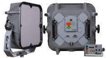
LRAD – Model 500 X-RE (Quantity: See Appendix A)