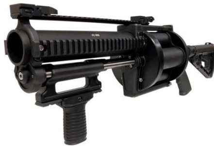
LMT – Model 1440 (pictured above)

Manufacturer Description: Designed for riot and tactical situations, the Model 1440 40mm Tactical 4-Shot Launcher is low-profile and lightweight, providing multi-shot capability in an easy to carry launcher. It features the Rogers Super Stoc expandable gun stock, an adjustable Picatinny mounted front grip, and a unique direct-drive system to advance the magazine cylinder.