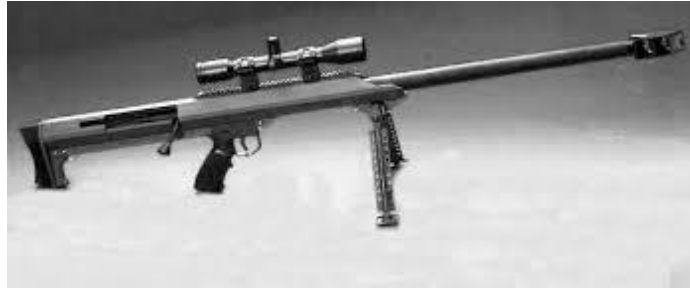
Barrett Model 99 (pictured above)

(Description and photo source: https://barrett.net/products/firearms/model-99/ )