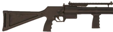
Penn Arms – Model GL1-40 (pictured above)

Manufacturer Description: A 40mm single-shot break-open frame launcher with a rifled barrel and fixed stock. Features include: Double-action trigger, trigger lock push button and hammer lock safeties.