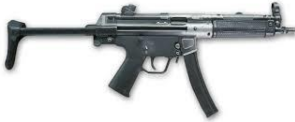
HK MP5 Submachine Gun (pictured above)

control when firing – HK features that are particularly appreciated by security forces and military users worldwide.