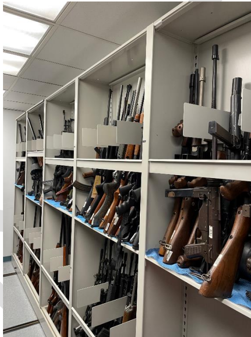
Crime Lab Firearms Division Storage Facility (pictured above)

Manufacturer Description: Various manufacturers. Various calibers, models, and types.