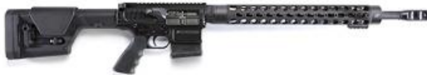
JP Enterprises LRP-07 (pictured above)

Manufacturer Description: The LRP-07 Designated Marksman Rifle is ready to take anything you can throw at it. Built on our new top-charge billet receiver set, this .308 Winchester platform performs with a wide variety of, ensuring that there's a load to fit your need. With the right ammo, this rifle will reliably offer you 1000-yard reach. It offers a good all-round package for the shooters looking for a step up in energy and horsepower from their AR-15. It's a great entry rifle for guys shooting long-range precision rifle matches in the Tactical Divisions.