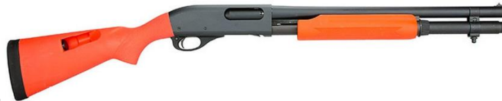
Remington 870 Police – 12 gauge Beanbag Shotgun (pictured above)

Manufacturer Description: The Remington 870 Police pump-action shotgun is a rugged 12-gauge with a short, tactical 18” barrel backed by a stout 3” chamber. The all-matte black gun is Parkerized for generalized durability and rust-resistance. Both the pump action forend and stock are robust and tough synthetic.