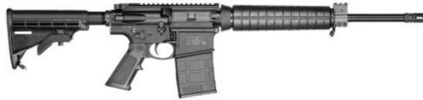
M&P 10 - .308 Semi-Automatic Rifle (pictured above)