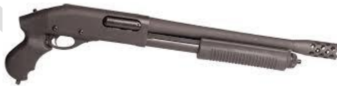
Remington 870 Police Magnum (pictured above)

Manufacturer Description: The Remington 870 Police Magnum pump-action shotgun is a rugged 12-gauge with a short, tactical 18” barrel backed by a stout 3” chamber. The all-matte black gun is Parkerized for generalized durability and rust-resistance. Both the pump action forend and stock are robust and tough synthetic.