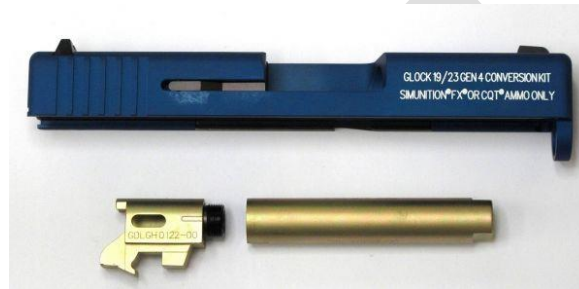
Simunition Glock 17 Barrel and Slide Assembly 9mm (pictured above)

Manufacturer Description: The Simunition conversion kit, conversion bolt, bolt carrier assembly and safety-ring insert allow the FX Marking Cartridges and the SecuriBlank to be fired safely from the user's own service weapon. These easy-to-install kits help preclude the inadvertent chambering of live ammunition and ensure the proper operation and cycling of the weapons. They are an integral part of the FX training system along with the FX marking cartridges and the FX protective equipment.