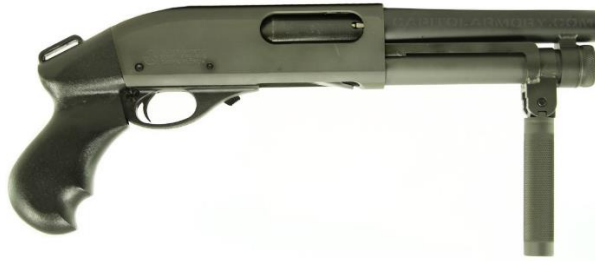
Serbu Super Shorty (pictured above)

Manufacturer Description: No manufacturer description.