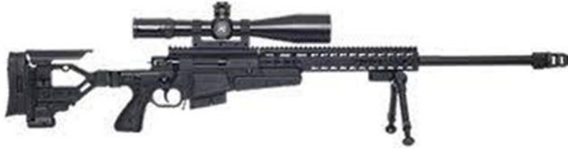
Accuracy International AX .308 Bolt Action Rifle (pictured above)

(Photo and description source: https://www.accuracyinternational.com/ax308.html )