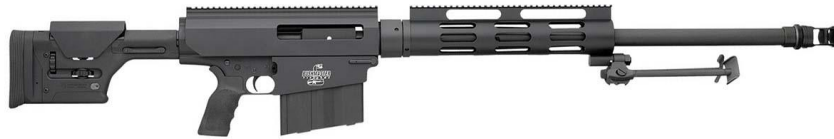
Bushmaster BA50 (pictured above)

Manufacturer Description: The Bushmaster BA50 Black Bolt Action Rifle – 50 BMG is built to outshine all previous standards for long-range accuracy. With a free-floated barrel with 1 in 15” twist and 8-groove rifling, the Bushmaster BA50 is ideally designed to harness optimal sub-MOA accuracy from the .50 BMG.