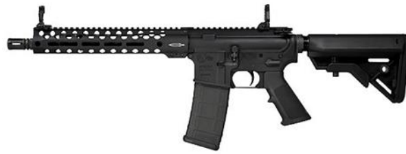
Colt Carbine LE 6933 Series (pictured above)

Bravo buttstock. The Colt EPR reestablishes the Colt AR-15 as the finest tool for local, regional, and national law enforcement agencies.