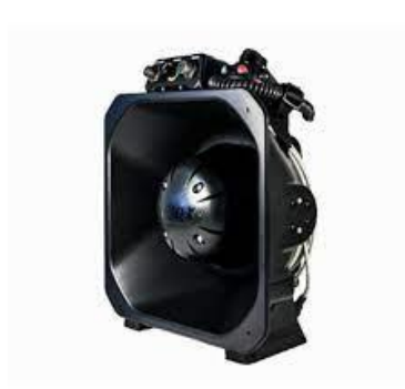
LRAD - Model 100X (Quantity: See Appendix A)

The Department currently possesses the following types of LRAD's: