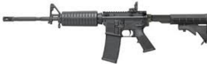
Colt M4 Carbine LE 6920 Series (pictured above)

Manufacturer Description: Throughout the world today, Colt's reliability, performance, and accuracy provide our Armed Forces the confidence required to accomplish any mission. Colt's LE6920 series shares many features of its combat-proven brother, the Colt M4.