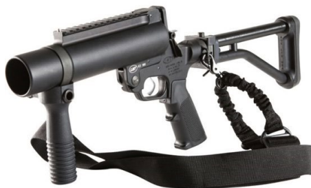
Def Tech – Model 1426 (pictured above)

Manufacturer Description: The 40LMTS is a tactical 40mm single shot launcher that features an adjustable Integrated Front Grip (IFG). The Ambidextrous Lateral Sling Mount (LSM) and QD mounting systems allow both a single and two point sling attachment. The 40LMTS will fire standard 40mm Less Lethal ammunition, up to 4.8 inches in cartridge length.