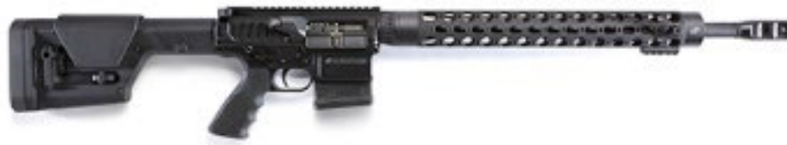
JP Enterprises LRP-07 (pictured above)

Manufacturer Description: The LRP-07 Designated Marksman Rifle is ready to take anything you can throw at it. Built on our new top-charge billet receiver set, this .308 Winchester platform performs with a wide variety of, ensuring that there's a load to fit your need. With the right ammo, this rifle will reliably offer you 1000-yard reach. It offers a good all-round package for the shooters looking for a step up in energy and horsepower from their AR-15. It's a great entry rifle for guys shooting long-range precision rifle matches in the Tactical Divisions.