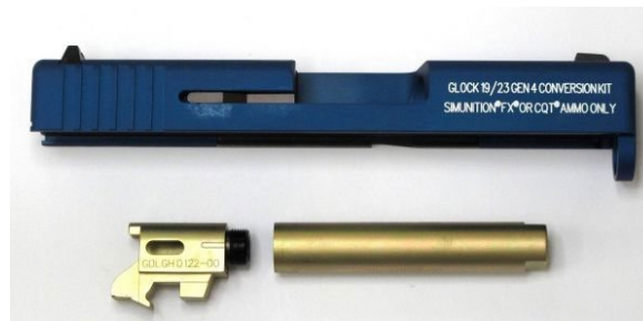
Simunition Glock 17 Barrel and Slide Assembly 9mm (pictured above)

Manufacturer Description: The Simunition conversion kit, conversion bolt, bolt carrier assembly and safety-ring insert allow the FX Marking Cartridges and the SecuriBlank to be fired safely from the user's own service weapon. These easy-to-install kits help preclude the inadvertent chambering of live ammunition and ensure the proper operation and cycling of the weapons. They are an integral part of the FX training system along with the FX marking cartridges and the FX protective equipment.