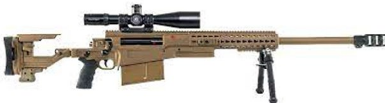
Accuracy International – AX-ELR 50 (pictured above)

Manufacturer Description: Designed to withstand constant deployment, the AX50 long range anti material rifle from Accuracy International is based on the DNA of the proven AW50. Inheriting the toughness, reliability, and ease of maintenance of its powerful predecessor, the AX50 exhibits all the features necessary to ensure superb accuracy and consistent cold shot performance in the harshest conditions.