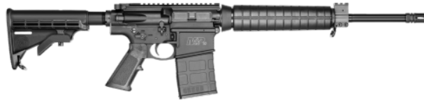
M&P 10 - .308 Semi-Automatic Rifle (pictured above)

Manufacturer Description: M&P10 Rifles are versatile, easily accessorized, and suitable for a wide variety of recreational, sport shooting and professional applications. Engineered with 5R Rifling and 1/10 Twist, the M&P10 is as accurate as it is powerful. Making short work of long range, M&P10 Rifles keep you at the ready.