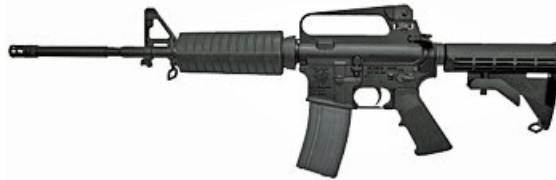
Olympic Arms 5.56 AR-15 (pictured above)

Manufacturer Description: No manufacturer description.