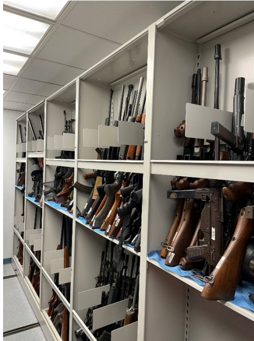
Crime Lab Firearms Division Storage Facility (pictured above)

Manufacturer Description: Various manufacturers. Various calibers, models, and types.