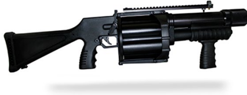
Penn Arms – Model PGL 65-40 (pictured above)

Manufacturer Description: A 40mm pump-action advance magazine drum launcher with a fixed stock and combo rail. It has a six-shot capacity and rifled barrel. Features include: Double-action trigger, trigger lock push button and hammer lock safeties.