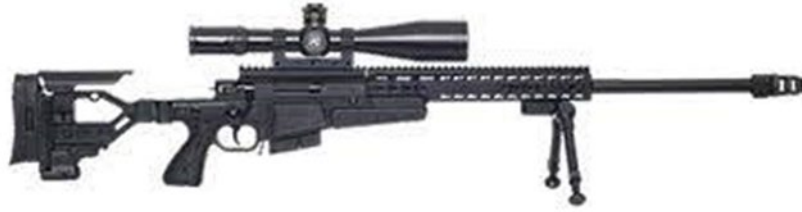
Accuracy International AX .308 Bolt Action Rifle (pictured above)

battle hardened AW308, boasting a raft of new features including the patented Quickloc system which allows the barrel to be changed or removed for transit in minutes using the hex key stored in the cheek piece.