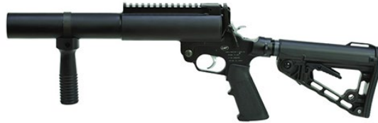
Def-Tec – Model 37mm Gas Gun (pictured above)

Manufacturer Description: No manufacturer description.