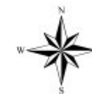
Bay Ho Improvements