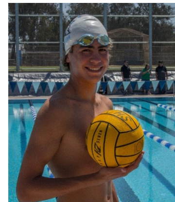
Standley Middle Pool