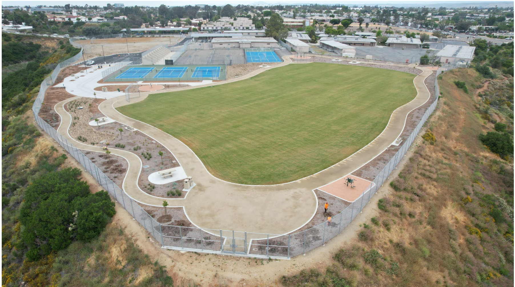
Taft Middle School Joint Use Facility