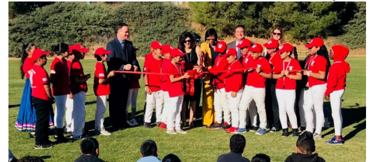
Encanto Elementary Joint Use Facility