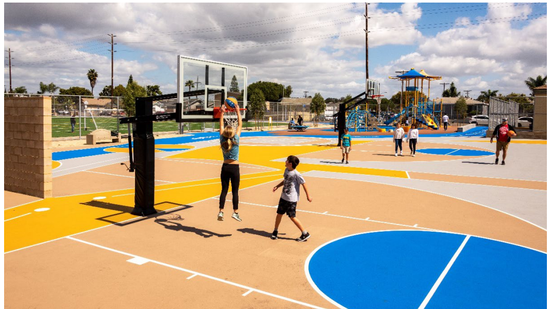
King Chavez Academy Joint Use Facility