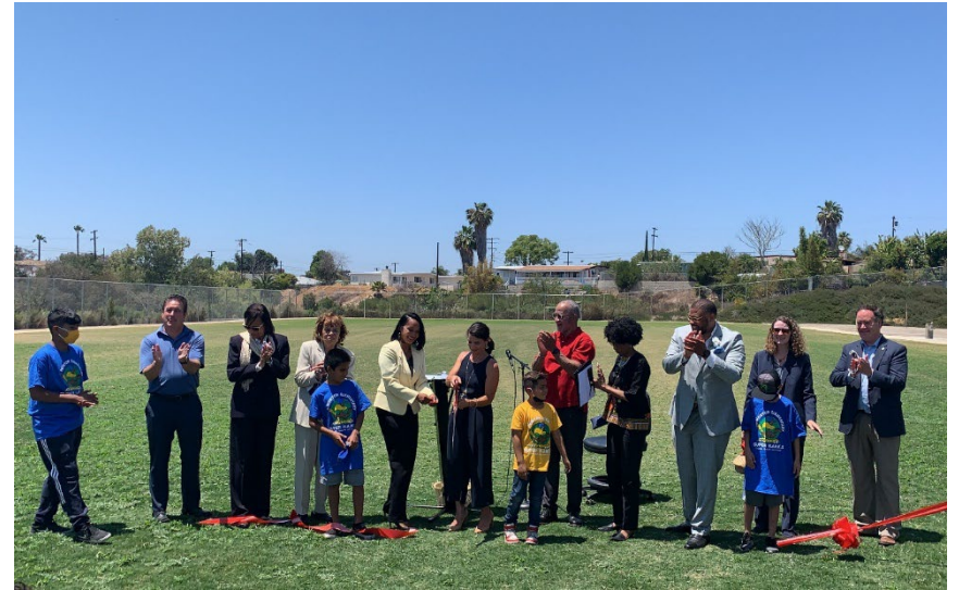
Horton Elementary Joint Use Facility