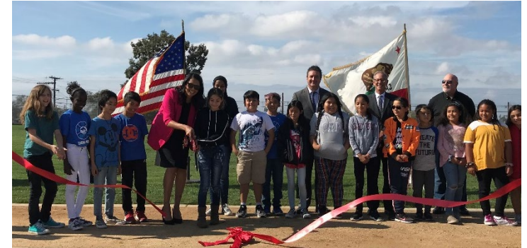
Linda Vista Elem Joint Use Facility