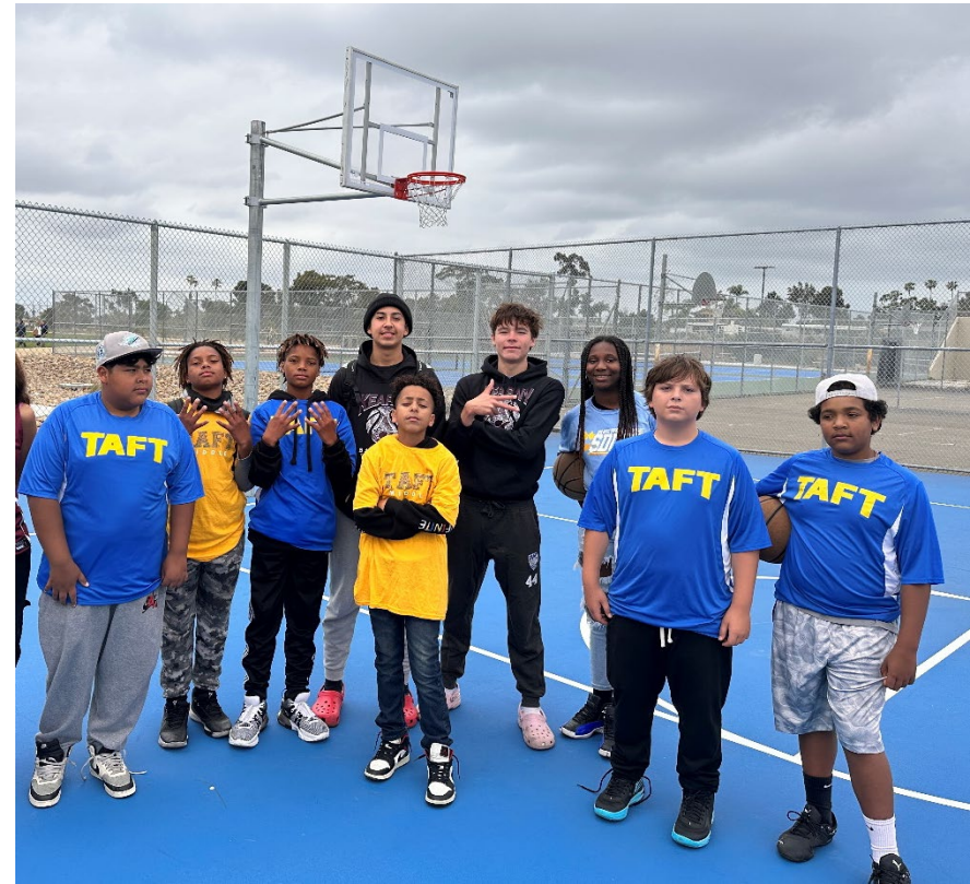
Taft Middle Joint Use Facility