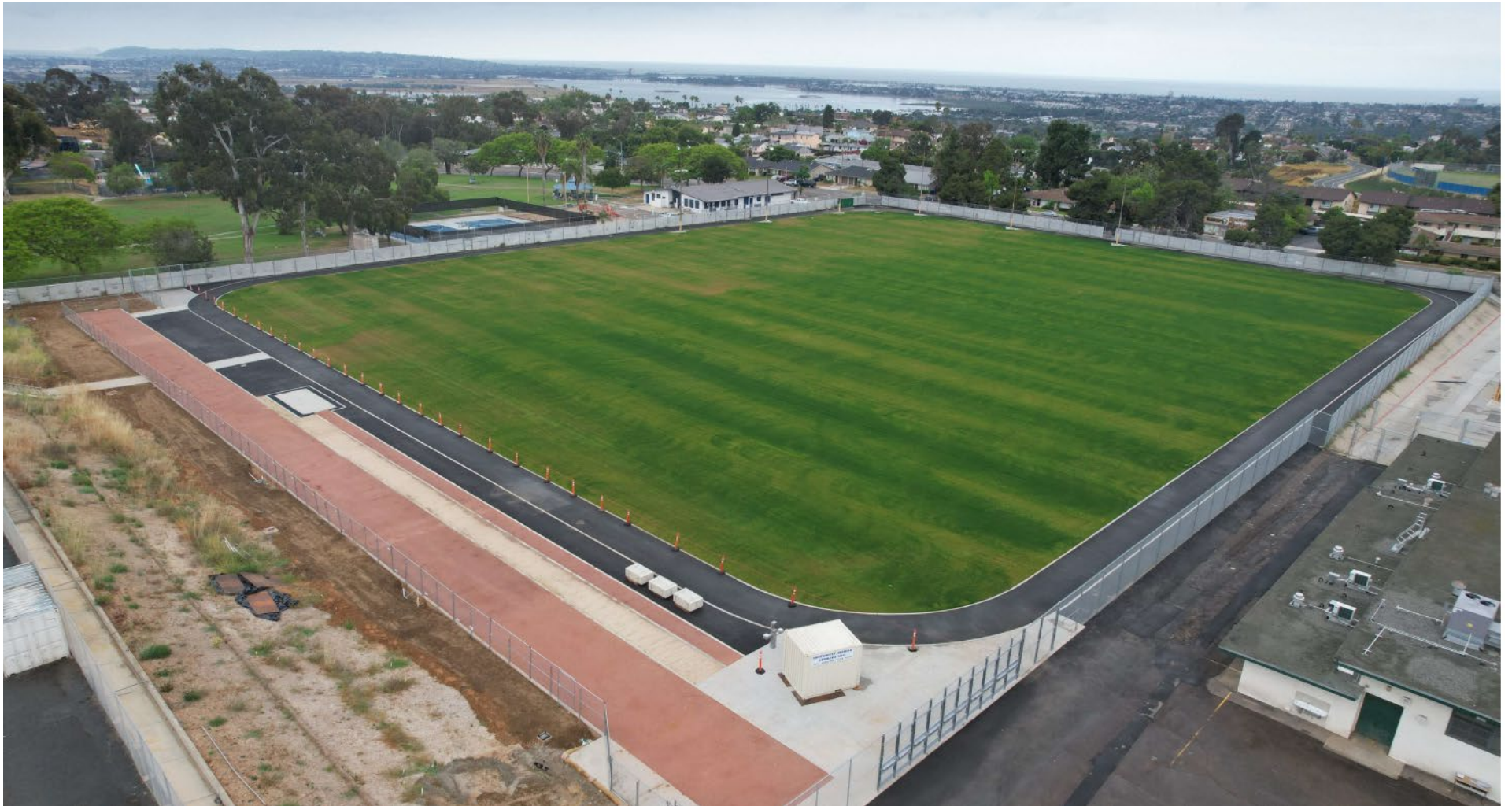
Marston Middle School Joint Use Facility