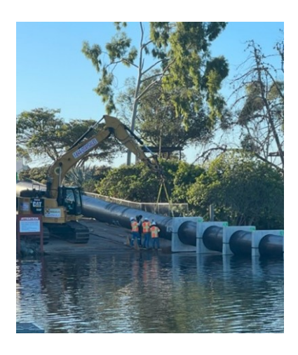
Construction crews fuse pieces of pipe together on land and string it out on Miramar Reservoir before installing it on the lakebed.

Pipeline construction continues with on-water barges.