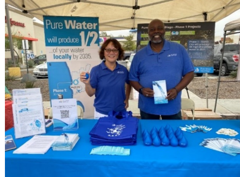
Pure Water at the Mira Mesa Street Fair.