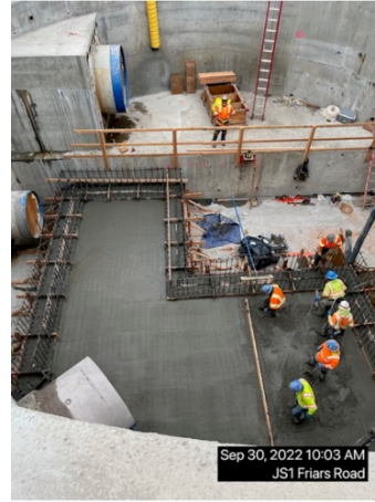
Construction continues at the Morena Pump Station.