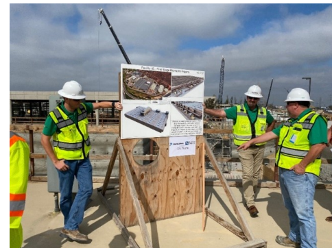
Engineers provide an overview of the construction expansion at the North City Water Reclamation Plant.

In-person tours are currently on hold to the public due to heavy construction around the Demonstration Facility site.