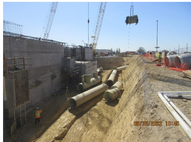
Construction of the mega trench and pipeline at the NCPWF.

Construction is continuing at the $360 million North City Pure Water Facility (NCPWF). Over the past few months, the team has been working on vertical construction of the Operations and Maintenance Building, Process Building and Ozone Contactors.