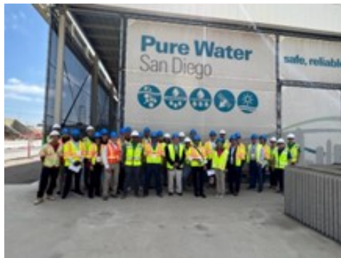
Members from the CMAA visit the Pure Water Demonstration Facility.