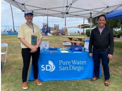
Mayor Todd Gloria visits the Pure Water booth at Walter Munk Day in La Jolla.

Interested in having the Pure Water team participate in an upcoming event? Please reach out at purewatersd@sandiego.gov .