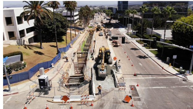
Pipeline construction on Executive Drive and Towne Centre Drive for the Morena Northern Pipelines and Tunnels project.

Pipeline construction is continuing along Executive Drive eastbound through the Judicial Drive intersection. Pictured here, at Towne Centre Drive and Executive Drive, the trench is approximately 20 feet deep and includes installation of two pipelines – the 48-inch wastewater pipeline and the 30-inch brine pipeline.