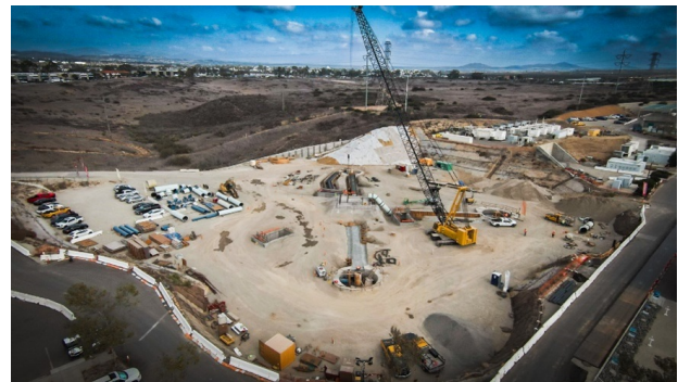
Construction at the NCWRP Expansion project.

Concrete is being poured for the first stage bioreactors and new secondary clarifiers. Demolition of internal components of the second stage bioreactors is underway to make way for new construction and interconnecting piping is being installed between treatment basins. Learn more about this project.