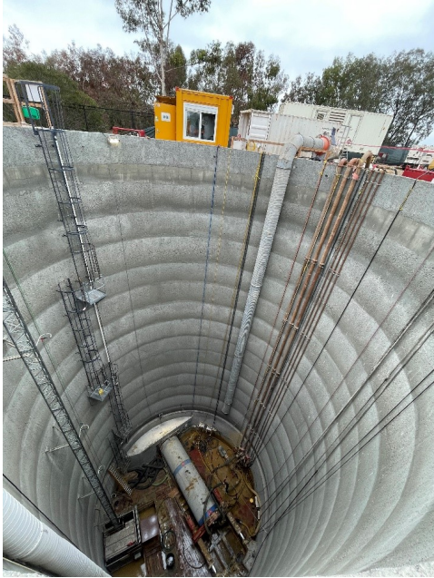
North City Pure Water Pipeline tunnel access structure near the Miramar Reservoir at the Miramar Drinking Facility.

Tunneling under Scripps Lake Drive was completed in October. This month, nighttime construction will begin on Miramar Road from Black Mountain Road to Clayton Drive. For more information, visit the project page .