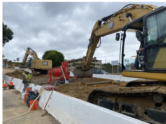
Pipeline construction is ongoing on Clairemont Drive for the Morena Conveyance South & Middle and Bikes lanes project.