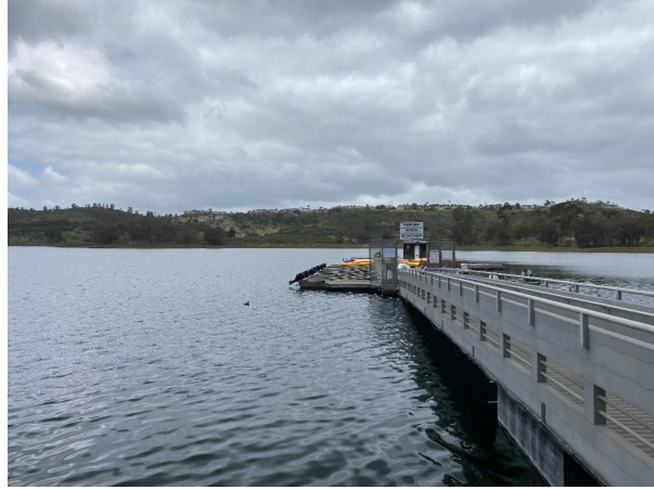
Subaqueous construction began at the Miramar Reservoir on September 5, 2023.

began for the Subaqueous Pipeline at Miramar Reservoir on Sept. 5, 2023. Shore areas, including picnic and BBQ areas, paths and shore fishing, will remain accessible. For safety, public activities on the water will be prohibited during construction.