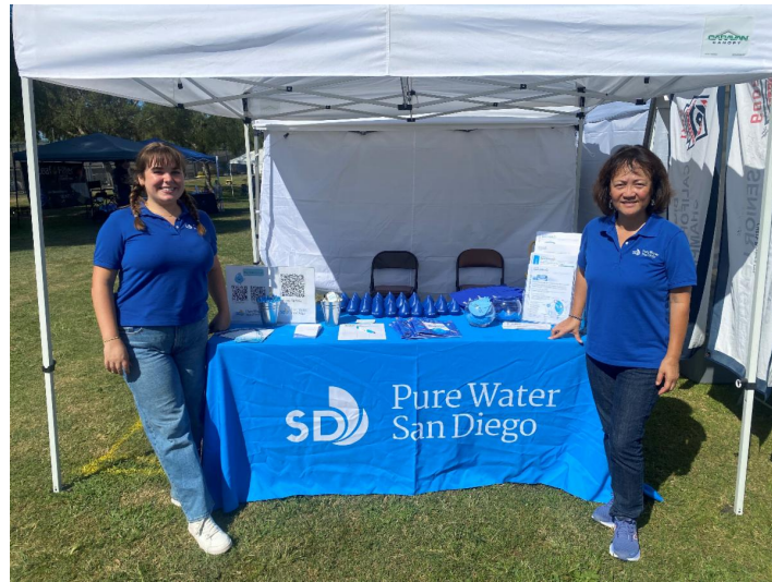
Pure Water Outreach Team at Clairemont Family Day on September 9, 2023.