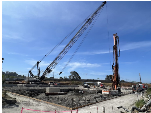
The Morena Pump Station under construction.

For the Morena Conveyance South & Middle and Bike Lanes project, more than 3,000 linear feet of pipeline has been installed and completed. Nighttime pipeline construction is ongoing on Clairemont Drive between 9 p.m. and 5 a.m. In early September, a second crew began pipeline construction at the intersection of Sherman Street and Banks Street. After work at the intersection is completed, they will be moving northeast on Sherman Street from Custer to Morena Boulevard. Work will be at night, from 9 p.m. to 5 a.m.