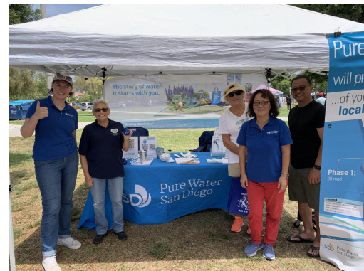
Pure Water Outreach Team at the Filipino-American Friendship Festival on July 22, 2023.