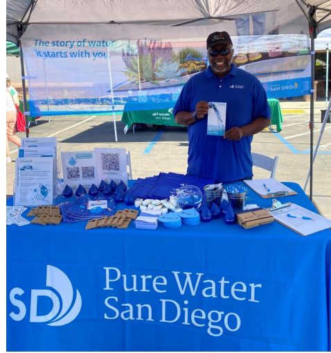
Pure Water Outreach Team at the Girl Scouts Volunteer Conference on August 26, 2023.