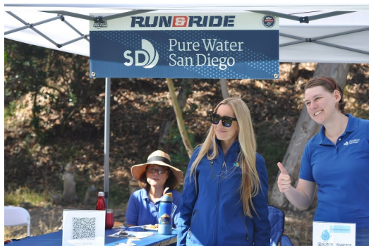
Pure Water Outreach Team at the Scripps Ranch Old Pros Fourth of July event at Hoyt Park.