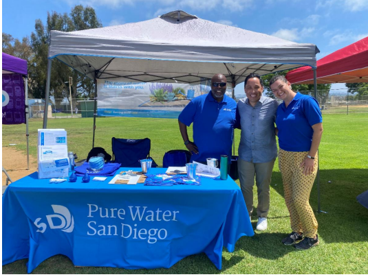
Pure Water Outreach Team at the Mayor's Back to School event on August 12, 2023.