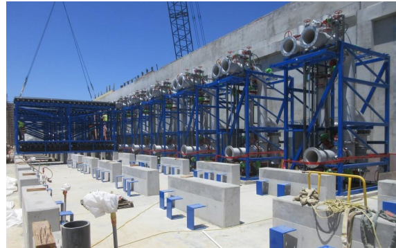
Mechanical and equipment installation activities are ramping up at the North City Pure Water Facility & Pump Station.

A new project sign has been installed at the North City Pure Water Facility and Pump Station , the cornerstone project of the suite of Pure Water projects. Additionally, more than 73% of the concrete structural work has been completed and the project is now 50% complete. Across the street at the North City Water Reclamation Plant (NCWRP) Expansion project, 100 daily craft employees are continuing construction of the project's new Flow Equalization Basin and installing underground pipe throughout the project.