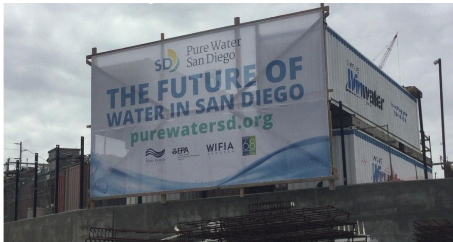
The Pure Water project sign has been installed and is facing the I-805 traffic traveling southbound near the Eastgate Mall bridge overcrossing.