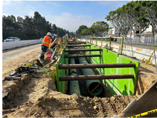
Pure Water construction crews are installing pipeline along Genesee Avenue in University City.

In University City for the Morena Pipelines Northern Alignment and Tunnels project, more than 8,000 linear feet of pipeline has been installed. In July 2023, crews completed the intersection crossing at La Jolla Village Drive and Towne Centre Drive ahead of schedule. Crews are currently working during the day from 7 a.m. to 5 p.m. on southbound Towne Centre Drive near Westfield UTC shopping center between La Jolla Village Drive and La Jolla Gateway. In mid-September, crews will begin work at the Genesee Avenue & Governor Drive intersection at night from 8 p.m. to 5 a.m. Please allow extra time when commuting near Genesee Avenue & Governor Drive.