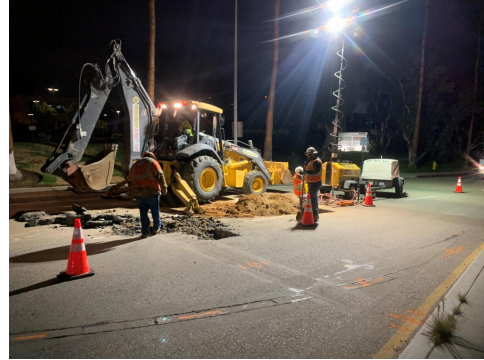
Utility work on Genesee Avenue is conducted in preparation for pipeline construction in 2022 (December 2021).