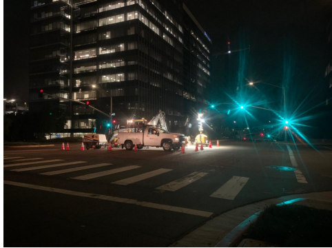
Workers complete utility work along Executive Drive for the Morena Northern Pipelines and Tunnels project (December 2021).

This month, underground utility work is scheduled to continue on Genesee Avenue from State Route 52 to Centurion Square. The work will provide confirmation of the exact location and depth of existing utilities in the public right-of-way before pipeline construction begins.