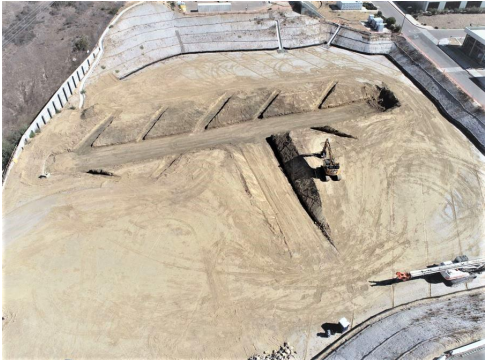
The North City Water Reclamation Plant is under construction with earth moving and site preparation. Seen here is an aerial shot looking westward onto the site. (Sept. 2021)