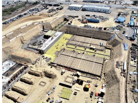
The North City Pure Water Facility project is making progress. This southwest aerial photo shows the foundation for the ozone building. (Sept. 2021)