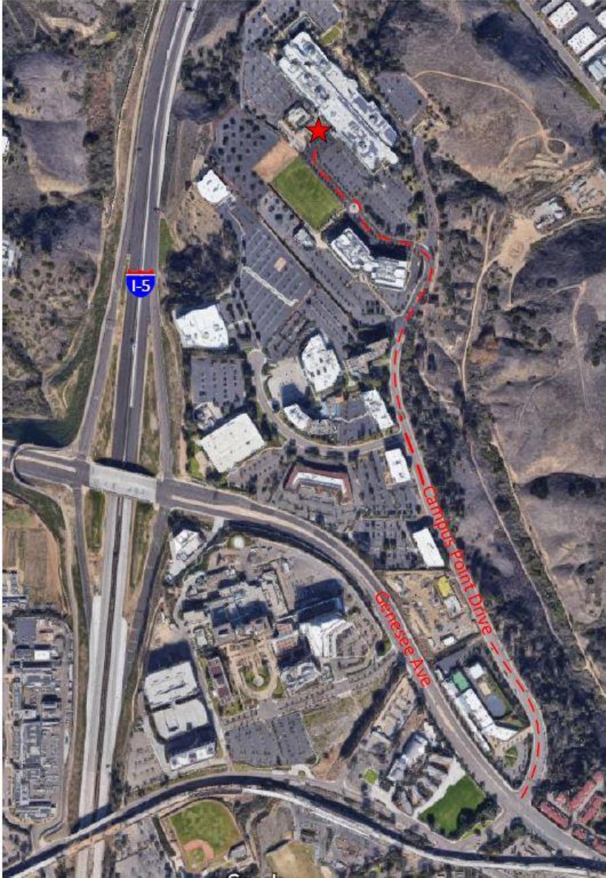
10300 Campus Point Drive

Take Genesee Avenue to Campus Point Drive, veering left at the end.