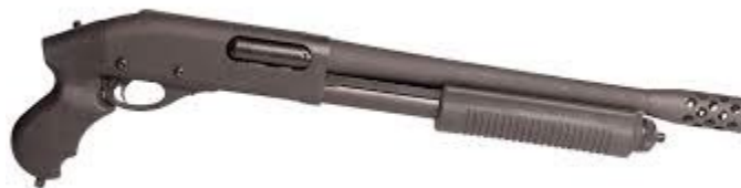
Remington 870 Police Magnum (pictured above)

Manufacturer Description: The Remington 870 Police Magnum pump-action shotgun is a rugged 12-gauge with a short, tactical 18” barrel backed by a stout 3” chamber. The all-matte black gun is Parkerized for generalized durability and rust-resistance. Both the pump action forend and stock are robust and tough synthetic.