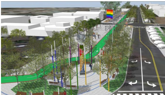
Normal Street promenade funded by Uptown CPD revenue

Community Parking Districts (CPDs) are entities established by City Council that oversee a defined area that is adversely impacted by parking. CPDs provide a mechanism whereby communities unable to meet existing parking demands may develop and implement parking management solutions to meet their specific needs and address parking impacts. Parking meter revenue collected in a CPD are reinvested back into the districts to finance neighborhood improvements such as sidewalk gaps, street furniture, and landscaping. The City has 5 CPDs, established in Downtown, Uptown, Mid-City, Pacific Beach, and Old Town. Initiatives supported by CPDs so far include neighborhood shuttles, wayfinding signages, curb ramps, parking meter installations, pedestrian promenades, and various design and planning studies.