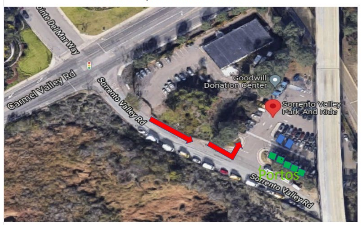
Sorrento Valley SAG - BTC 50 & 100 Mile Rides