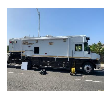
Emergency Negotiations Team (ENT) Command Vehicle - (Quantity: See Appendix A)

Manufacturer Description: No description available. (Custom build)