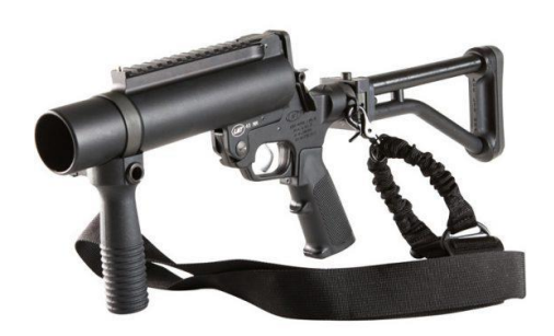
Def Tech – Model 1426 (pictured above)

<u>Manufacturer Description</u>: The 40LMTS is a tactical 40mm single shot launcher that features an adjustable Integrated Front Grip (IFG). The Ambidextrous Lateral Sling Mount (LSM) and QD mounting systems allow both a single- and two-point sling attachment. The 40LMTS will fire standard 40mm Less Lethal ammunition, up to 4.8 inches in cartridge length.