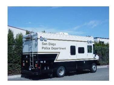
Mobile 2 – Command Post Vehicle - (Quantity: See Appendix A)

Mobile 2 is a 24-foot Mobile Command Post Vehicle.