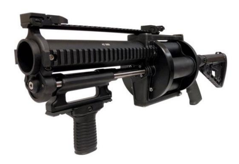
LMT – Model 1440 (pictured above)

<u>Manufacturer Description</u>: Designed for riot and tactical situations, the Model 1440 40mm Tactical 4-Shot Launcher is low-profile and lightweight, providing multi-shot capability in an easy to carry launcher. It features the Rogers Super Stoc expandable gun stock, an adjustable Picatinny mounted front grip, and a unique direct-drive system to advance the magazine cylinder.