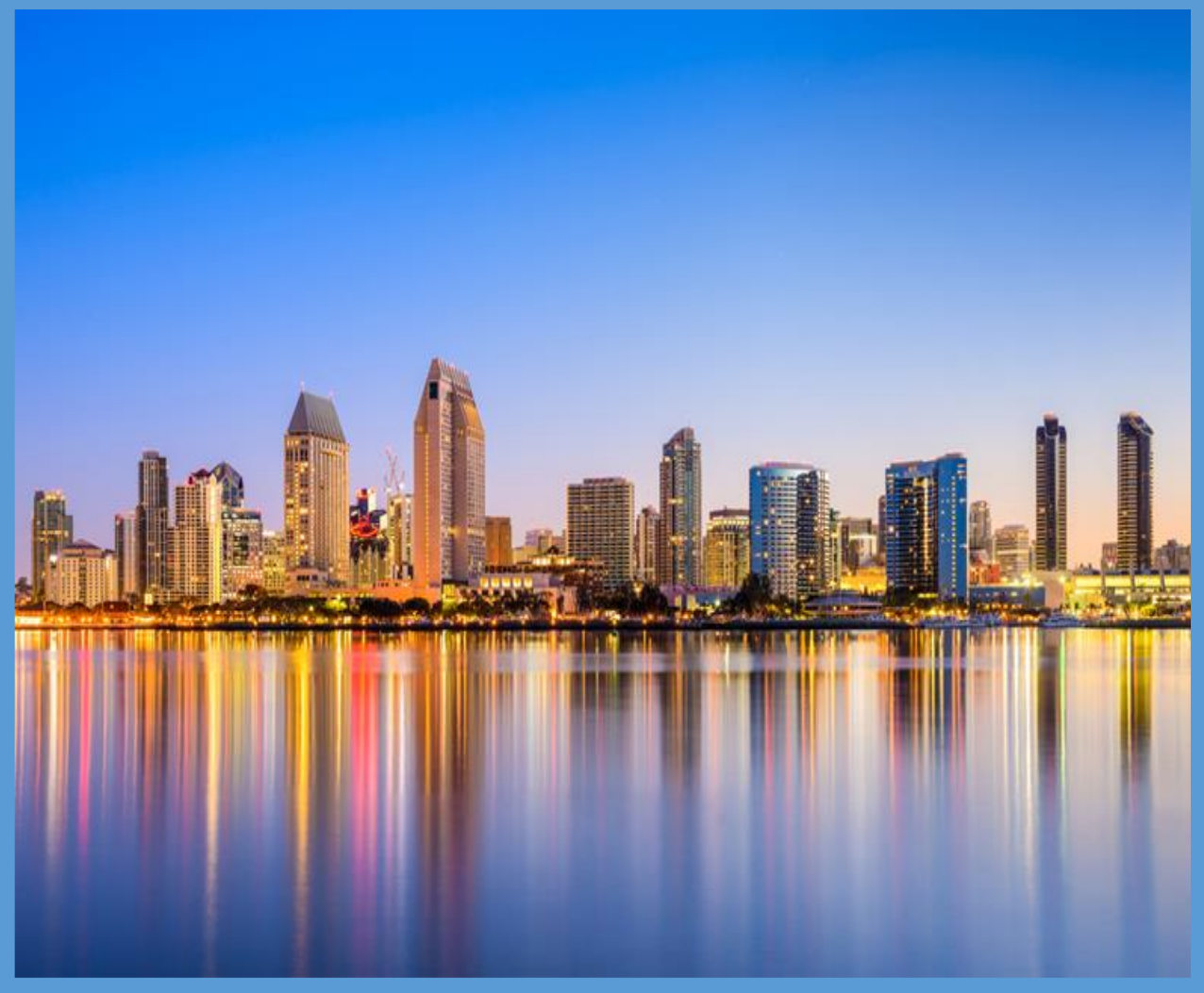
Annual Military Equipment Report 2024