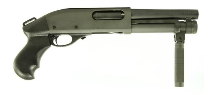
Serbu Super Shorty (pictured above)

Manufacturer Description: No manufacturer description.