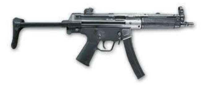
HK MP5 Submachine Gun (pictured above)

<u>Manufacturer Description</u>: Probably the most popular series of submachine guns in the world, it functions according to the proven roller-delayed blowback principle. Tremendously reliable, with maximum safety for the user, easy to handle, modular, extremely accurate and extraordinarily easy to control when firing – HK features that are particularly appreciated by security forces and military users worldwide.