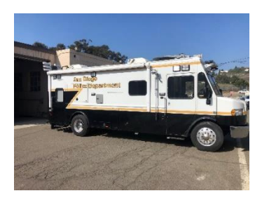
Mobile 4 – Command Post Vehicle (Quantity: See Appendix A)

Manufacturer Description: No description available. (Custom build)