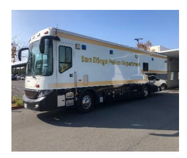
Mobile 3 – Mobile Decontamination/ Prisoner Processing Vehicle (Quantity: See Appendix A)

Manufacturer Description: No description available. (Custom build)