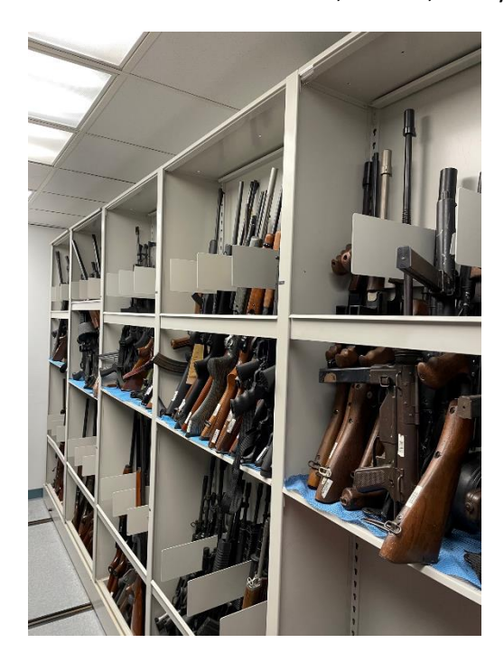
Crime Lab Firearms Division Storage Facility (pictured above)

Manufacturer Description: Various manufacturers. Various calibers, models, and types.