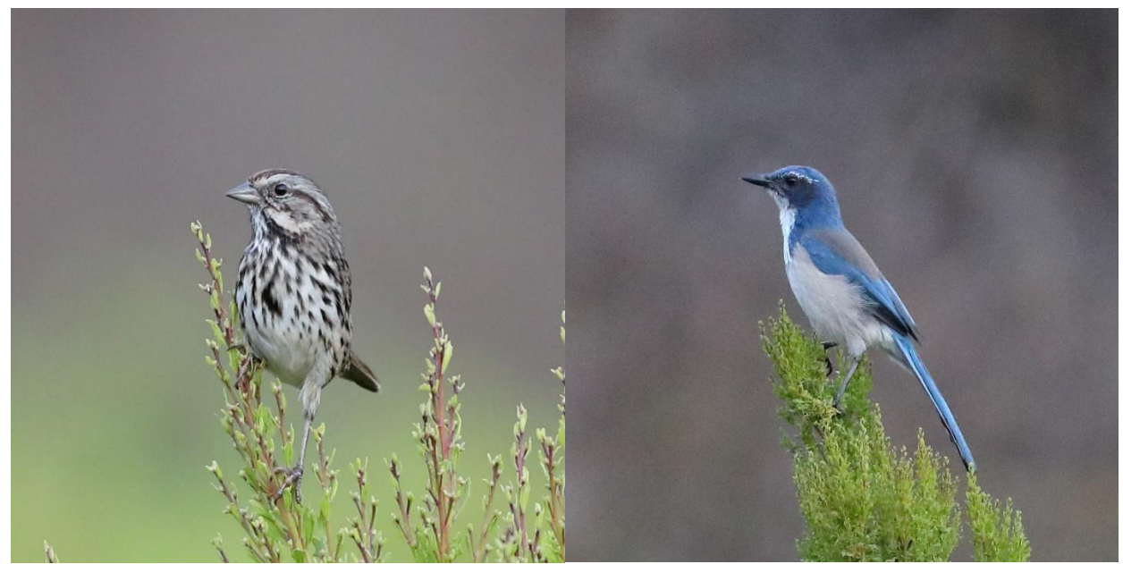
Photos 19 and 20. Song sparrow (left), and California scrub-jay (right) on the survey site, 7 September 2024.