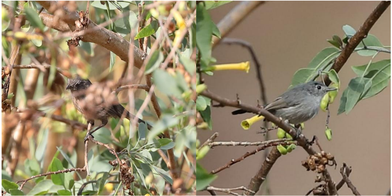
Photos 5 and 6. Wrentit (left) and California gnatcatcher (right) on the survey site, 7 September 2024.