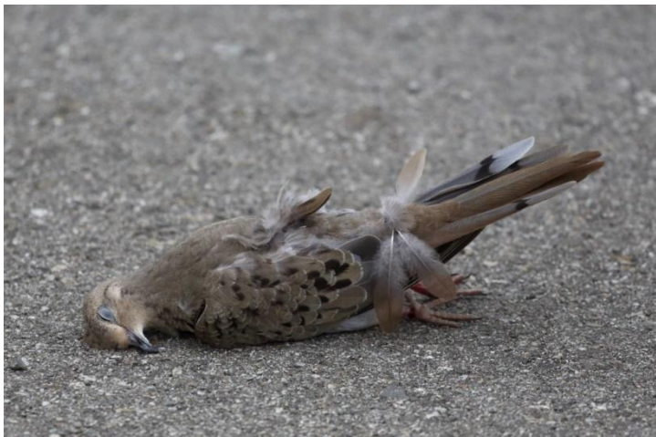
Photo 31. Mourning dove killed by vehicle on a California road. Photo by Noriko Smallwood, 21 June 2020.