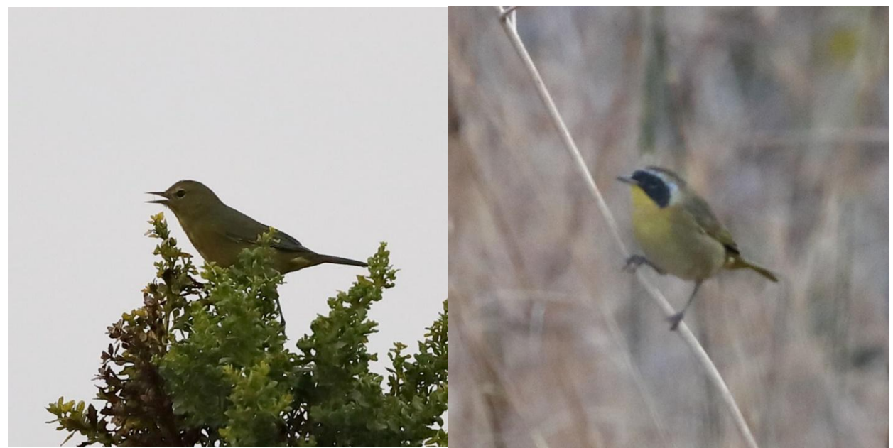
Photos 23 and 24. Orange-crowned warbler (left), and common yellowthroat (right) on the survey site, 7 September 2024.