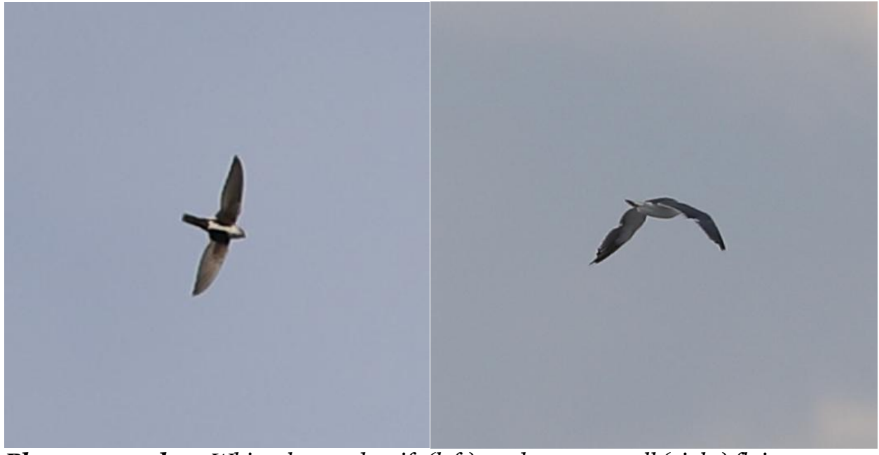
Photos 13 and 14. White-throated swift (left), and western gull (right) flying over the survey site, 7 September 2024.