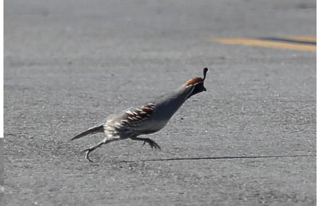
Photo 30. A Gambel's quail dashes across a road on 3 April 2021. Such road crossings are usually successful, but too often prove fatal to the animal.

Project-generated traffic would endanger wildlife that must, for various reasons, cross roads used by the project's traffic to get to and from the project site (Photos 30-32), including along roads far from the project footprint. Vehicle collisions have accounted for the deaths of many thousands of amphibian, reptile, mammal, bird, and arthropod fauna, and the impacts have often been found to be significant at the population level (Forman et al. 2003). Across North America traffic impacts have taken devastating tolls on wildlife (Forman et al. 2003). In Canada, 3,562 birds were estimated killed per 100 km of road per year (Bishop and Brogan 2013), and the US estimate of avian mortality on roads is 2,200 to 8,405 deaths per 100 km per year, or 89 million to 340 million total per year (Loss et al. 2014). Local impacts can be more intense than nationally.