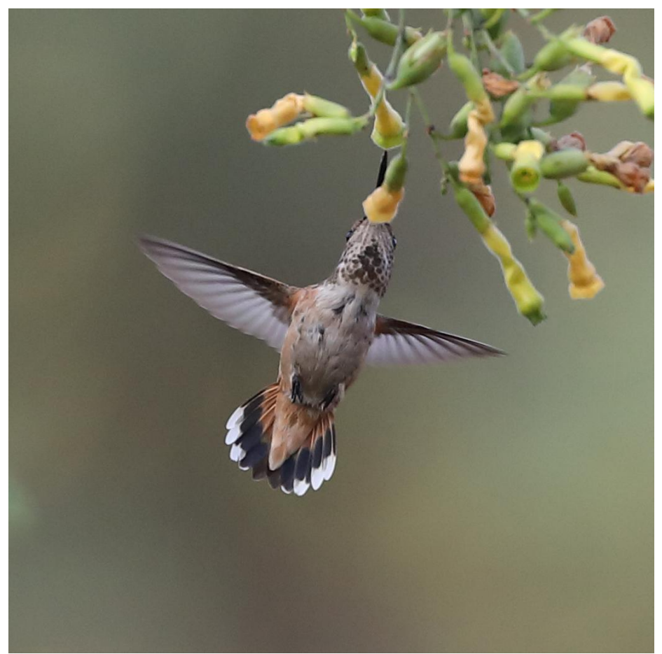
Photo 4. Rufous hummingbird on the survey site, 7 September 2024.