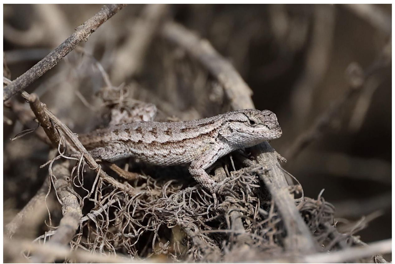
Photo 29. Great Basin fence lizard on the survey site, 7 September 2024.