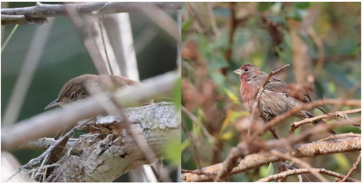
Photos 10 and 11. House wren (left), and house finch (right) on the survey site, 7 September 2024.