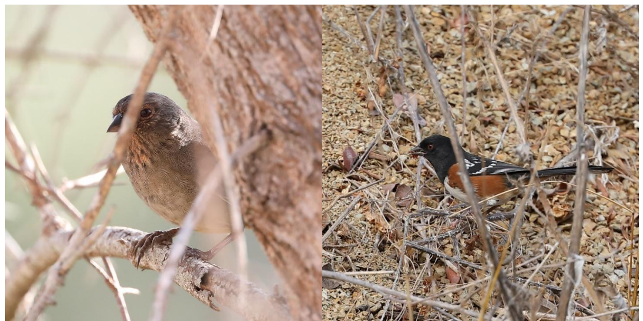
Photos 15 and 16. California towhee (left), and spotted towhee (right) on the survey site, 7 September 2024.