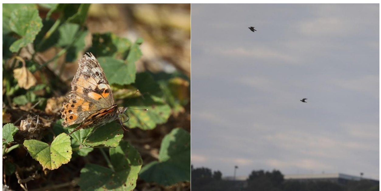
Photos 25 and 26. Painted lady (left), and mourning dove (right) on the survey site, 7 September 2024.