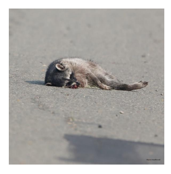
Photo 32. Raccoon killed on Road 31 just east of Highway 505 in Solano County. Photo taken on 10 November 2018.

The nearest study of traffic-caused wildlife mortality was performed along a 2.5-mile stretch of Vasco Road in Contra Costa County, California. Fatality searches in this study found 1,275 carcasses of 49 species of mammals, birds, amphibians and reptiles over 15 months of