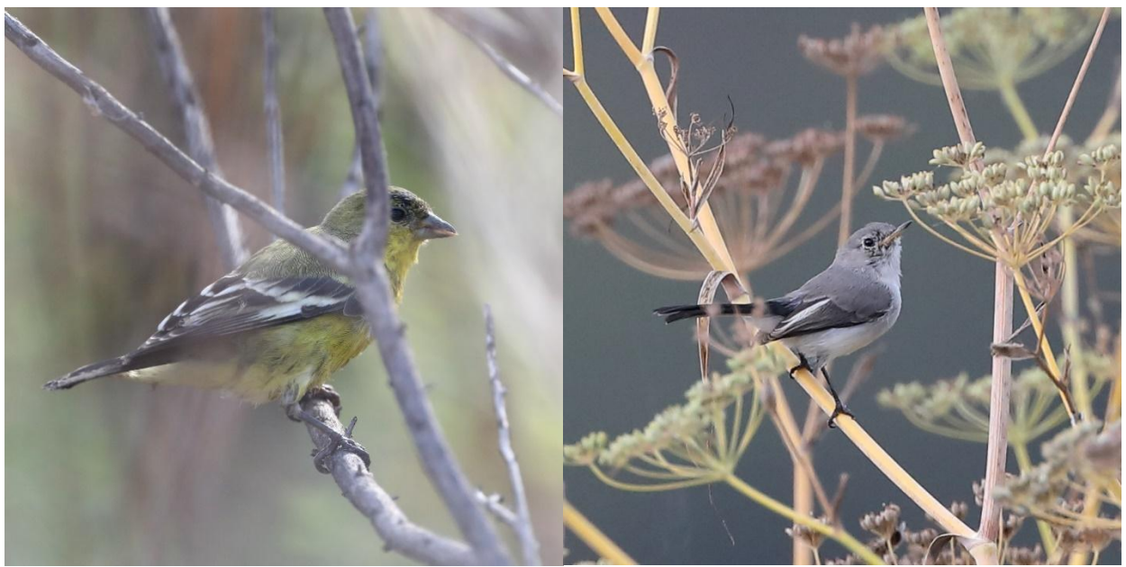
Photos 17 and 18. Lesser goldfinch (left), and blue-gray gnatcatcher (right) on the survey site, 7 September 2024.