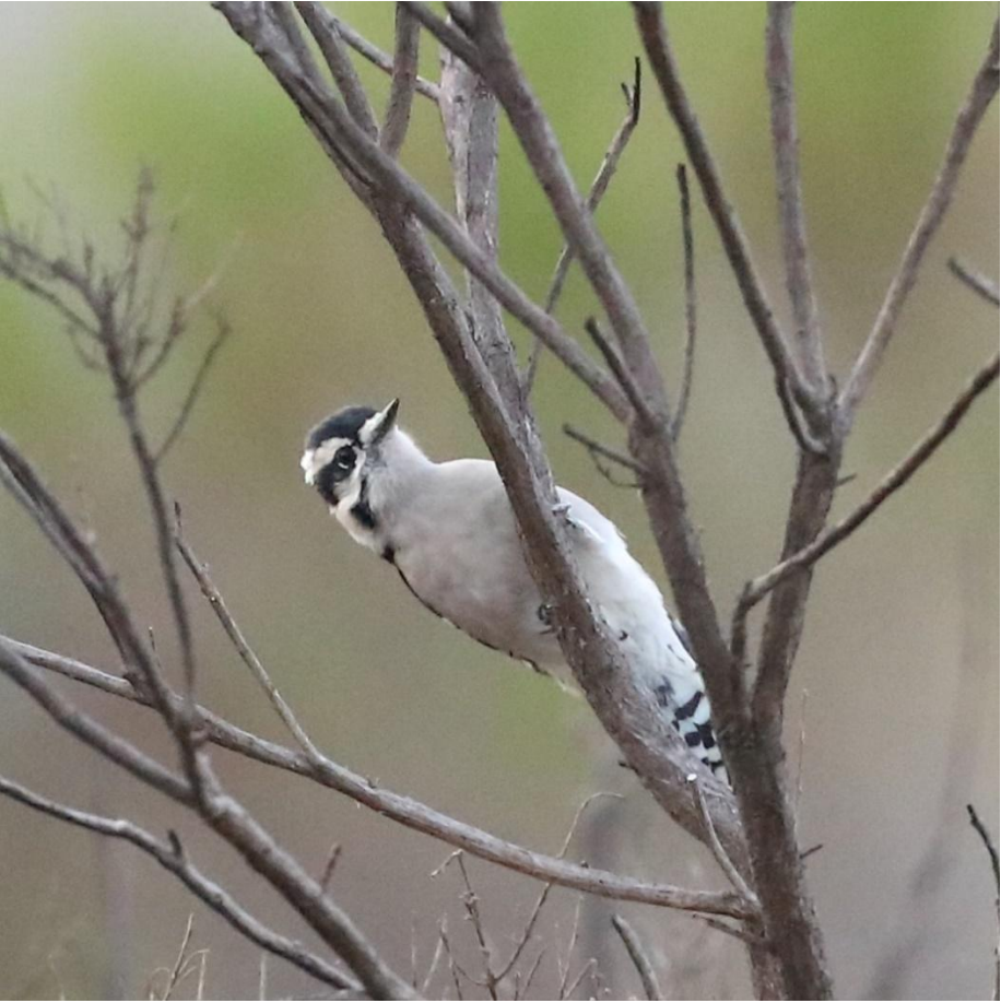
Photo 7. Downy woodpecker on the survey site, 7 September 2024.