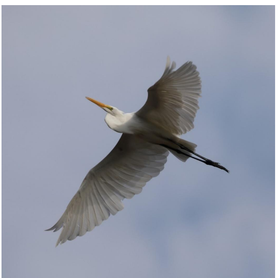
Photo 12. Great egret flying over the survey site, 7 September 2024.