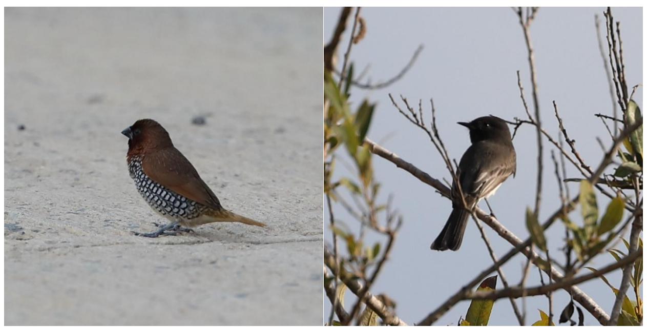
Photos 21 and 22. Scaly-breasted munia (left), and black phoebe (right) on the survey site, 7 September 2024.