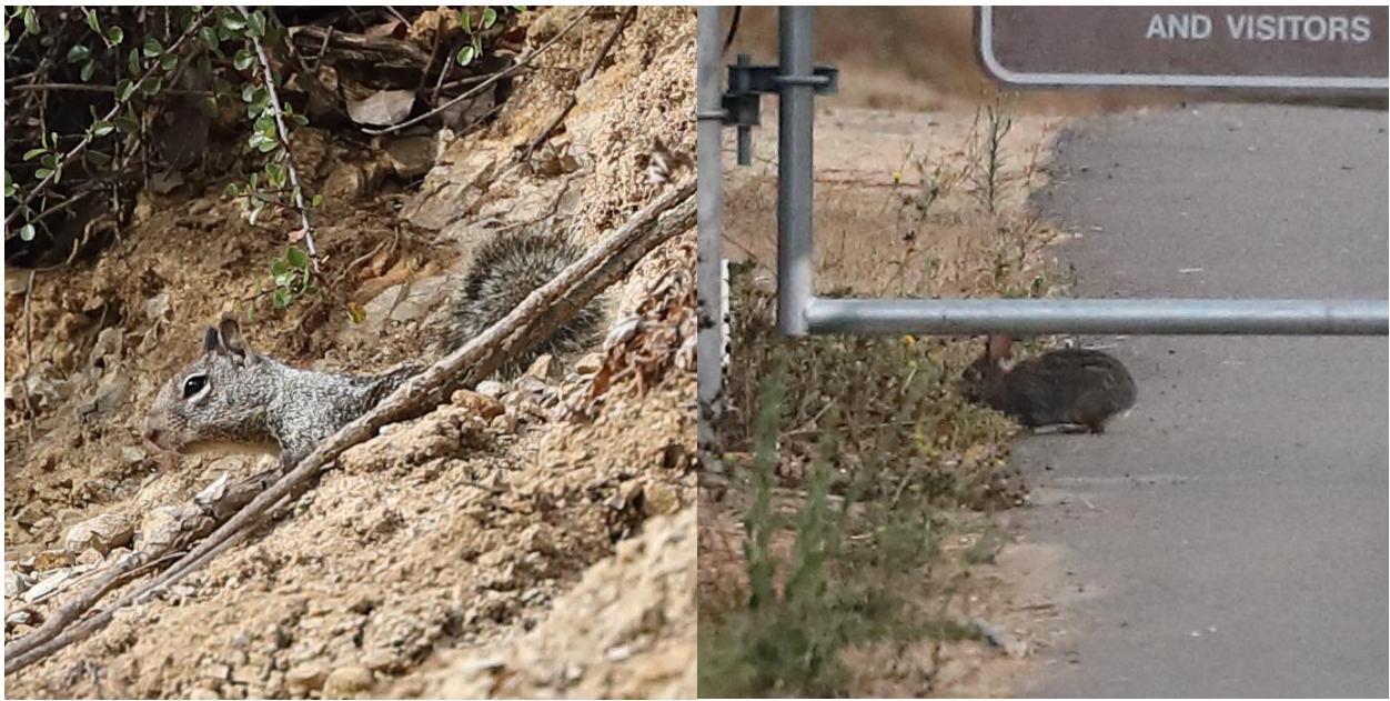
Photos 27 and 28. California ground squirrel (left), and desert cottontail (right) on the survey site, 7 September 2024.