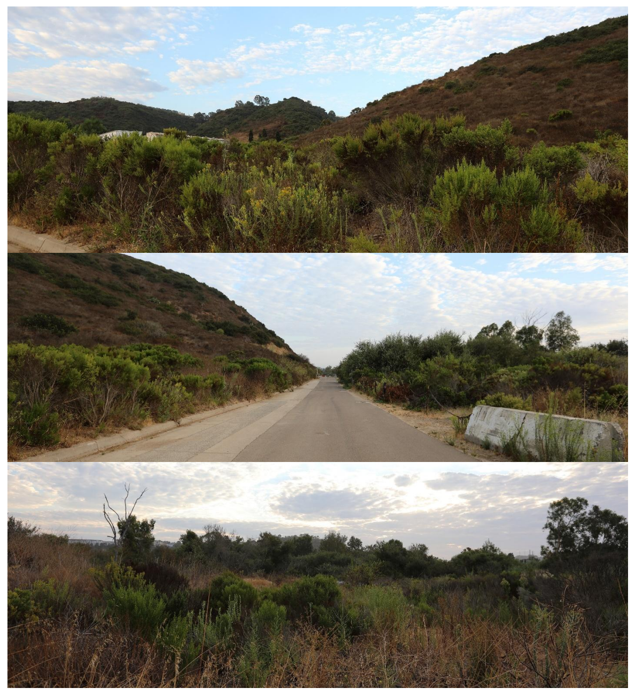
Photos 1, 2, and 3. Views of the project site, 7 September 2024.

Conditions were partly cloudy with 3 MPH south wind and temperatures of 70-80° F. The vegetation surrounding Flintkote Ave included sage scrub, chaparral, and riparian (Photos 1, 2, and 3).