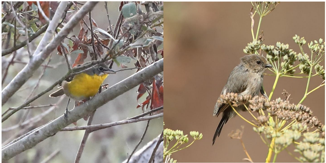
Photos 8 and 9. Yellow-breasted chat (left) and bushtit (right) on the survey site, 7 September 2024.