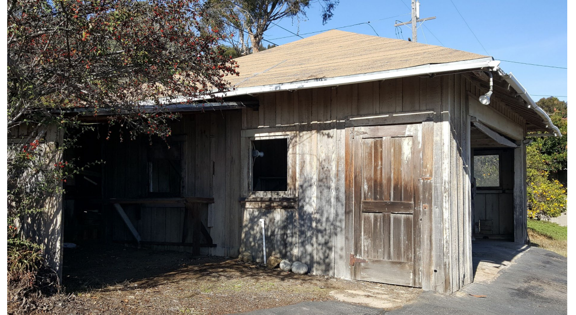
South Elevation; View Facing North