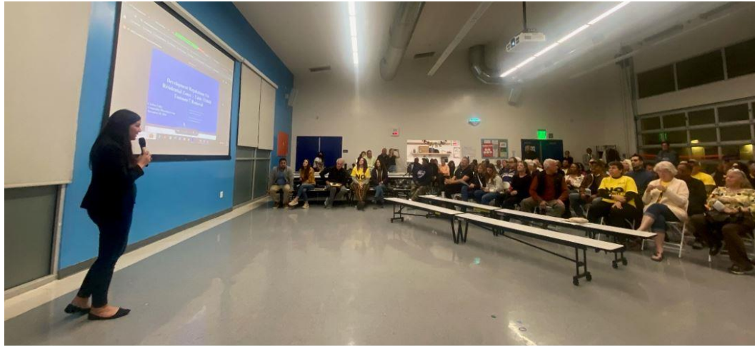
Director of City of San Diego Planning Dept at CVCPG meeting of November 18, 2024