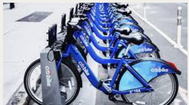
Citibike Station in New York City

The New York City Housing Authority is investing approximately $25 million in e-bike charging infrastructure at 53 sites. The charging hubs are expected to be installed by 2025 and will provide a reliable charging source to riders within the City. The investment will provide micromobility users with a safe outdoor place to charge and store their devices while reducing the burden of in-home storage and reducing the risk of fires that may be caused by lithium-ion batteries.