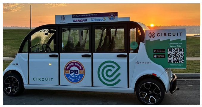
Pacific Beach shuttle