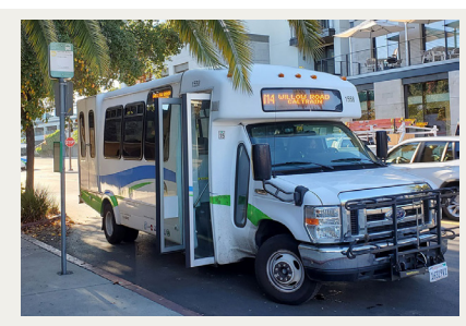
Menlo Park shuttle

A neighborhood shuttle program offers shuttle services within a community, using either a fixedroute or zone-based structure. Fixed-route shuttles follow a set path, while zone-based shuttles provide door-to-door service within a designated area. These programs connect residents to key destinations like shopping centers, schools, medical services, and local attractions. When partially funded through neighborhood sources, such as community parking district revenue, these shuttles can be financially self-sustaining. From July 2023 through October 2024, the City of San Diego and SANDAG ran a pilot neighborhood electric vehicle (NEV) shuttle service in Pacific Beach, providing a sustainable way for residents and visitors to reach beachside destinations. Since August 2016, the FRED service has offered a similar NEV option in Downtown San Diego. The City's experience with the Beach Bug pilot and ongoing FRED service has informed new contract options for expanding neighborhood shuttle services. Programs like these can be launched in other San Diego communities, enhancing mobility and bridging gaps in public transportation.