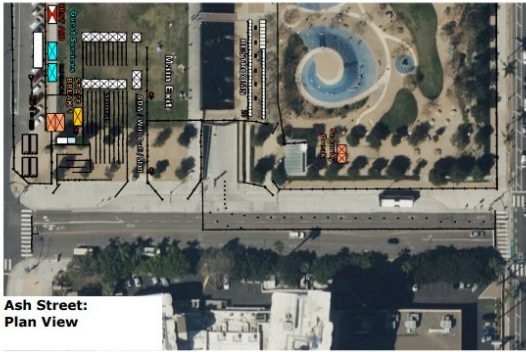
Ash Street: Plan View