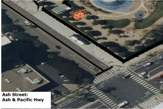
Ash Street: Ash & Pacific Hwy