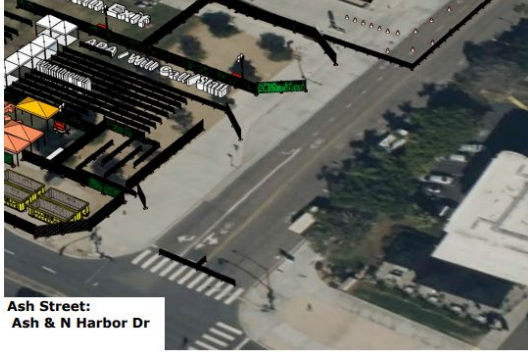
Ash Street: Ash & N Harbor Dr