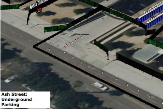
Ash Street: Underground Parking