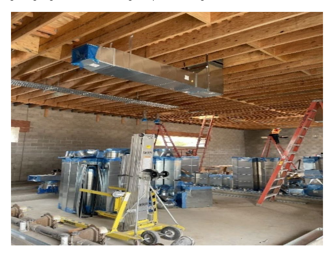
Ongoing installation of CMU at Equipment Building

HVAC is beginning to get installed on ceiling of Aquatic Building