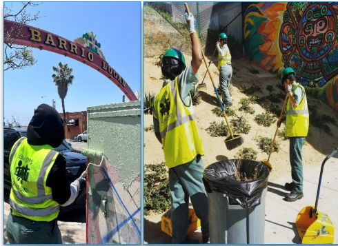
Beautification / Landscape Maintenance Barrio Logan MAD