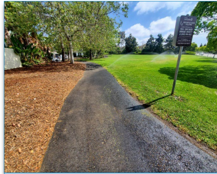
Greenbelt Improvement Carmel Valley MAD