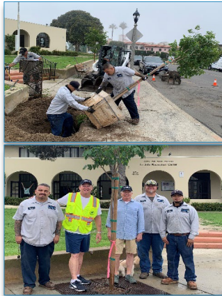
Pink Trumpet Tree Planting La Jolla MAD