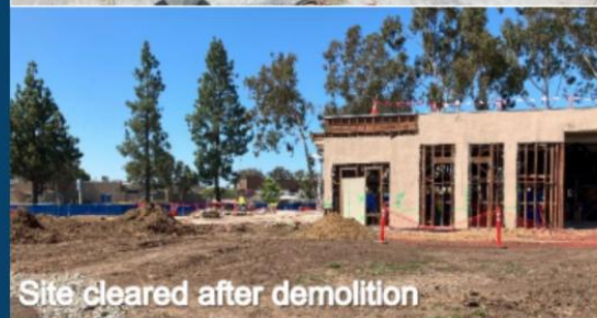
Site cleared after demolition