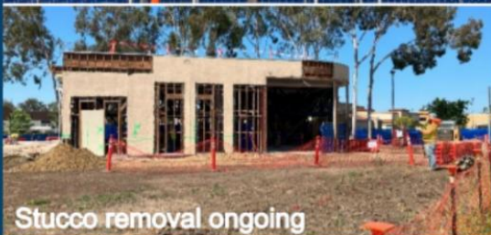
Stucco removal ongoing