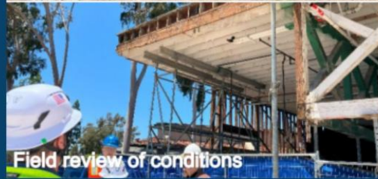
Field review of conditions

City of San Diego Summer Programs are here!