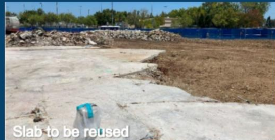
Slab to be reused