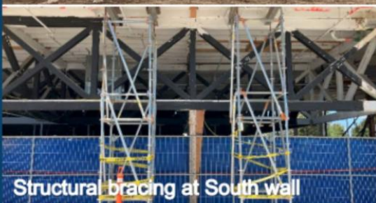
Structural bracing at South wall