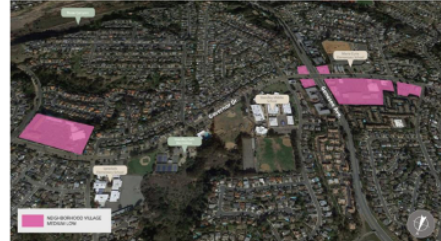
Neighborhood Village – Medium Low