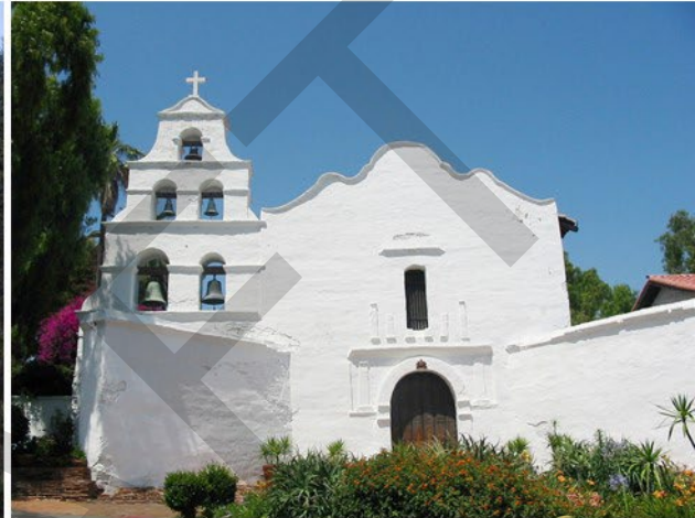
Mission San Diego de Alcalá