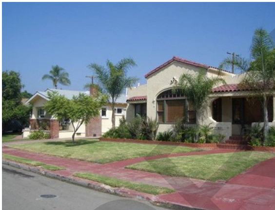
Burlingame Historic District

The successful implementation of a historic preservation program requires widespread community support. Creating support for historic preservation requires public understanding of the significant contributions of historical resources to the quality and vitality of life, aesthetic appeal, and cultural environment of the City. In order to better inform and educate the public on the merits of historic preservation, information on the resources themselves, as well as the purpose and objectives of the preservation program, must be developed and widely distributed.