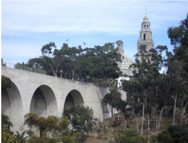
Cabrillo Bridge and Balboa Park

The NHPA was amended in 1980 to create the Certified Local Government (CLG) program, administered through the State Office of Historic Preservation (OHP). This program allows for direct local government participation and integration in a comprehensive statewide historic preservation planning process. Cities and counties with CLG status may compete for preservation funds allocated by the Congress and awarded to each state.