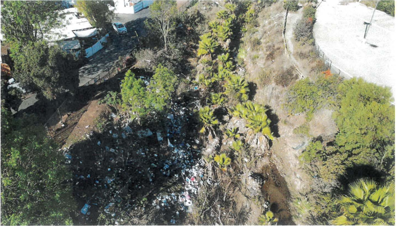
4. Channel Debris Behind Earl B. Gilliam Post Office to the West Image 3