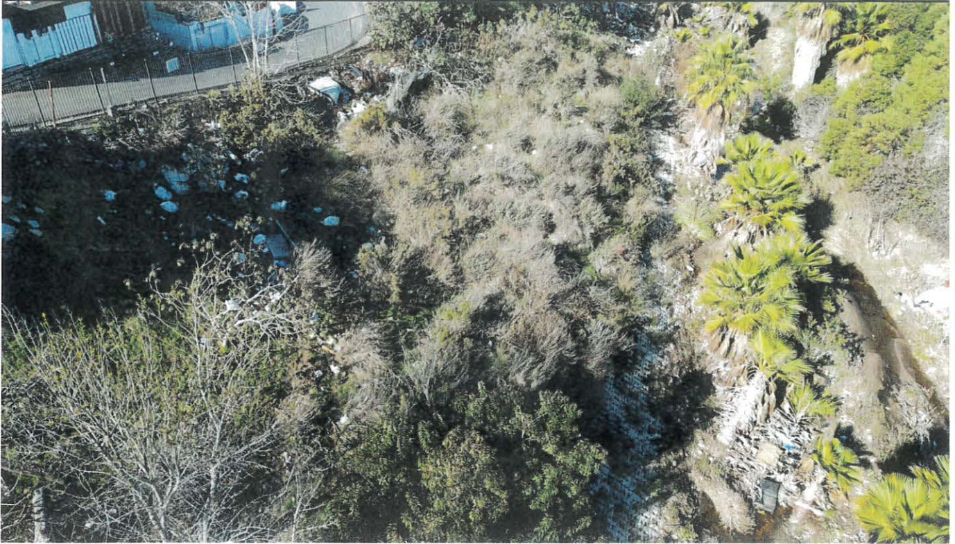
6. Channel Debris Behind Earl B. Gilliam Post Office to the South Image 5