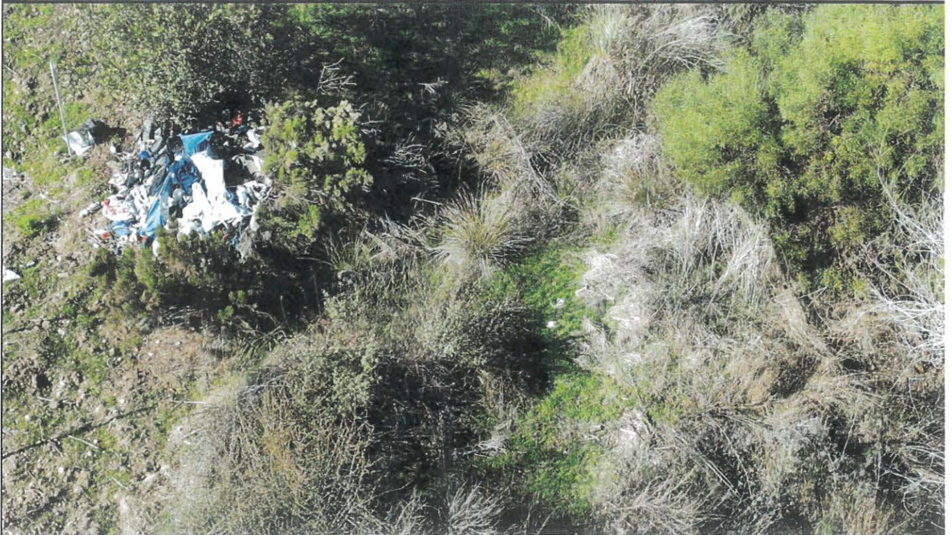
8. Channel Debris Behind Earl B. Gilliam Post Office to the South Image 7