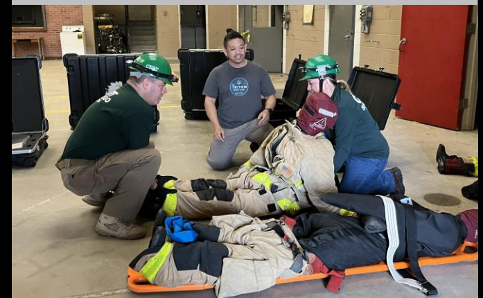
Con Ed: Safe Lifting