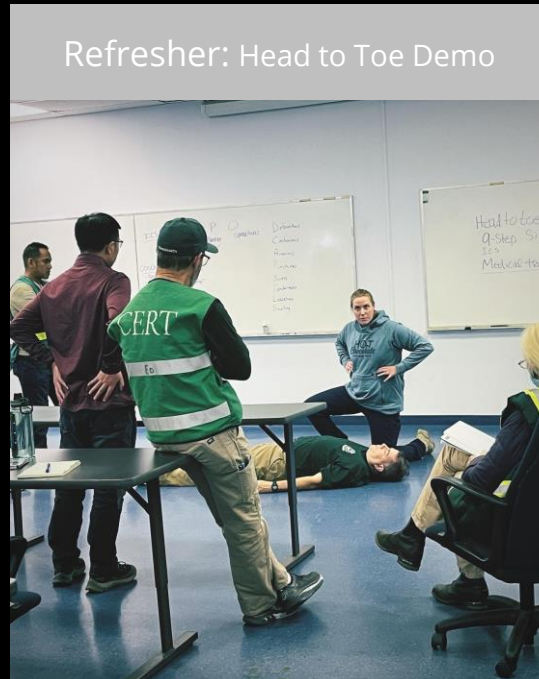
Refresher: Head to Toe Demo