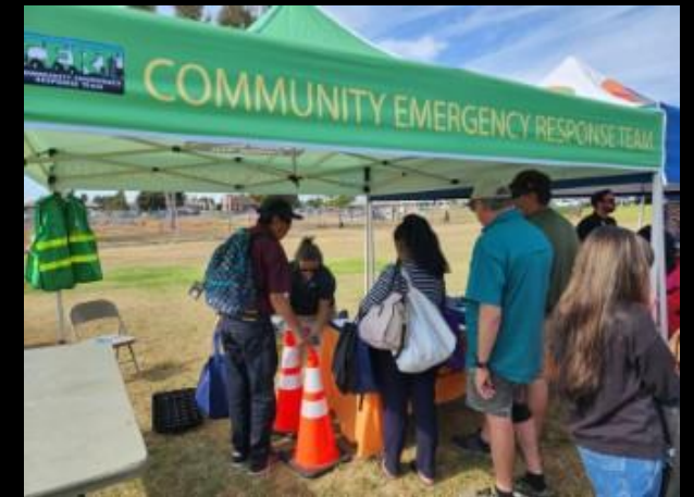
Community Outreach: National Night Out