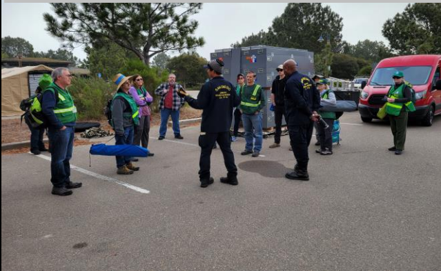
Con Ed: MobEx with USAR