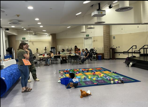
Community Outreach: Library