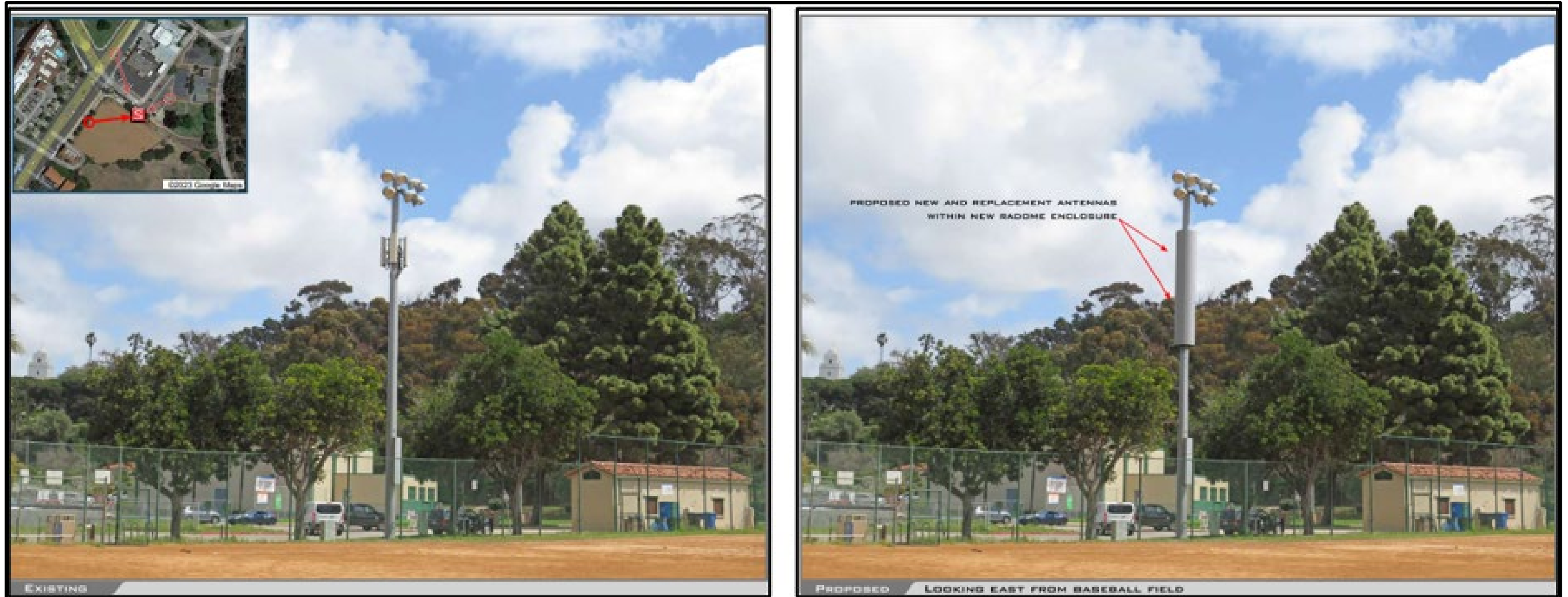
Looking east from the baseball field near Taylor St.