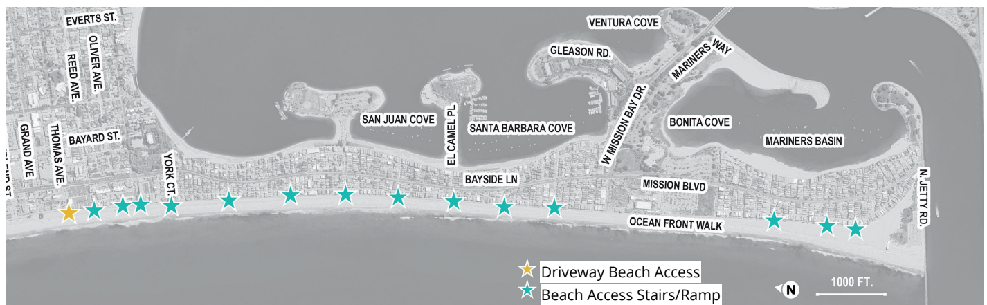
Pedestrian Access Improvement Areas