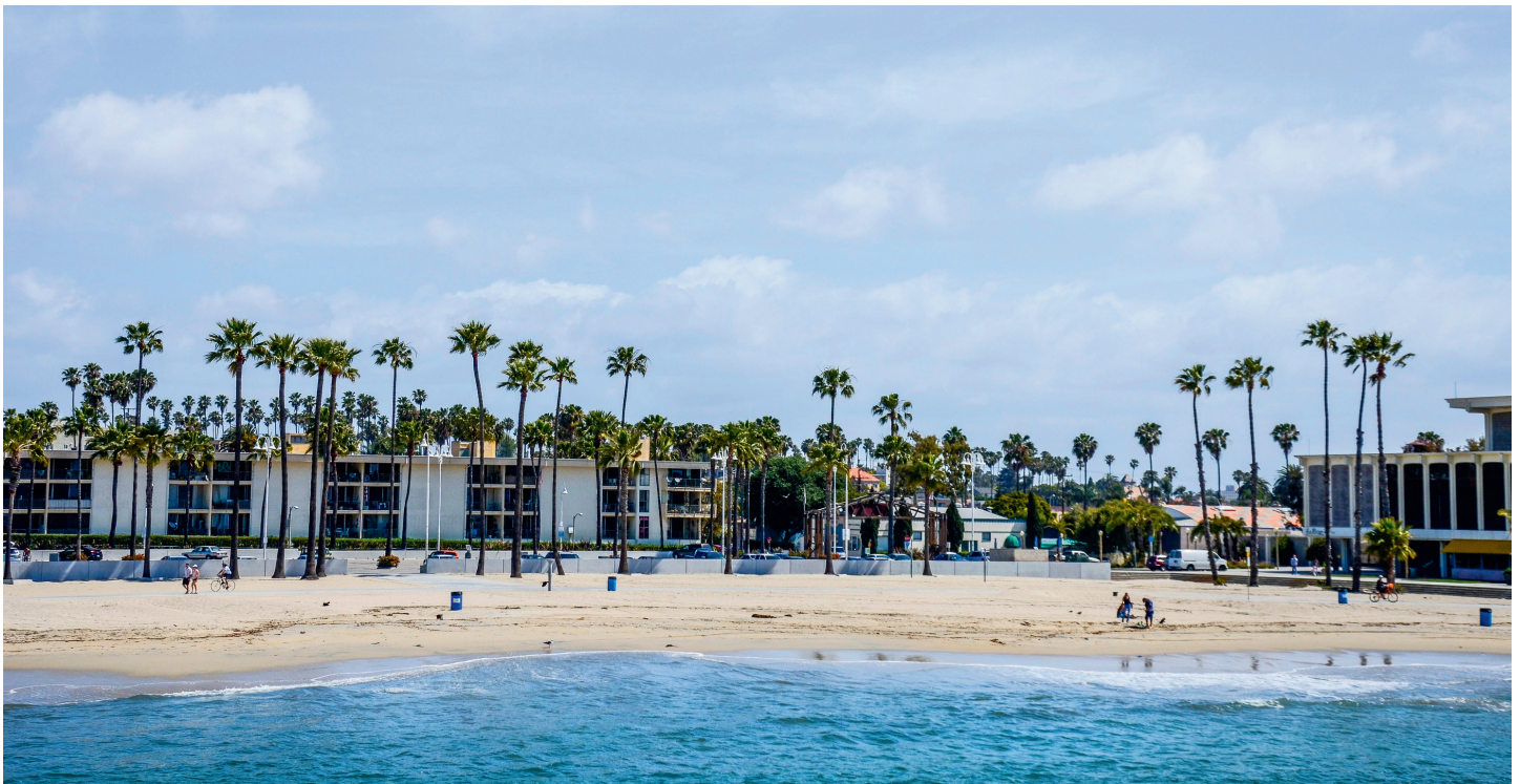
The seawall helps protect Mission Beach from coastal erosion.