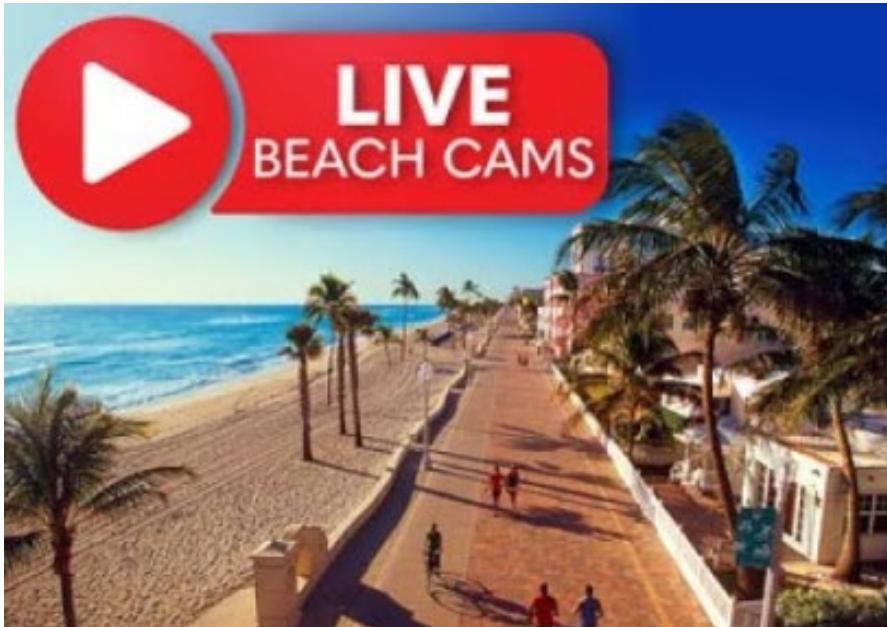
Hollywood Beach, Boardwalk, FL

Elephant Seal Cam: https://elephantseal.org/live-view/