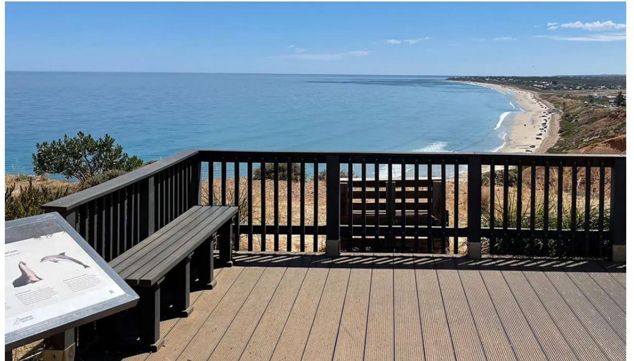
Sellicks Beach, South Australia

Elephant Seal Cam: https://elephantseal.org/live-view/