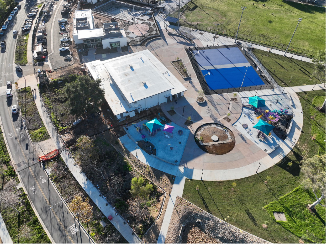
Aero View Entry Plaza