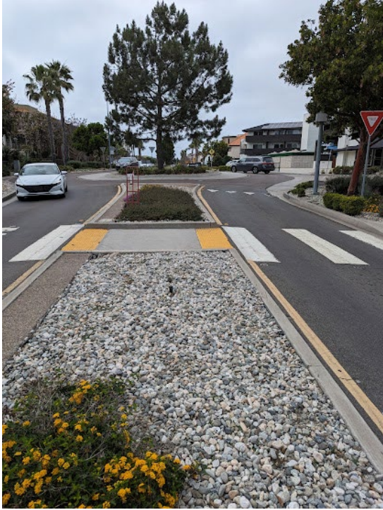
North of the Camino de la Costa roundabout