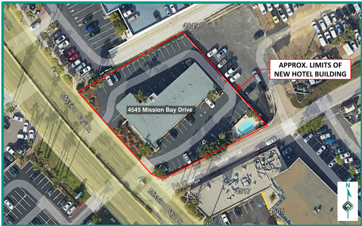
Existing Site Map

We understand you are evaluating the subject property for a potential new development consisting of a 3- to 4-story hotel building with up to 2 levels of subterranean parking with associated underground utilities, driveways and landscaping.