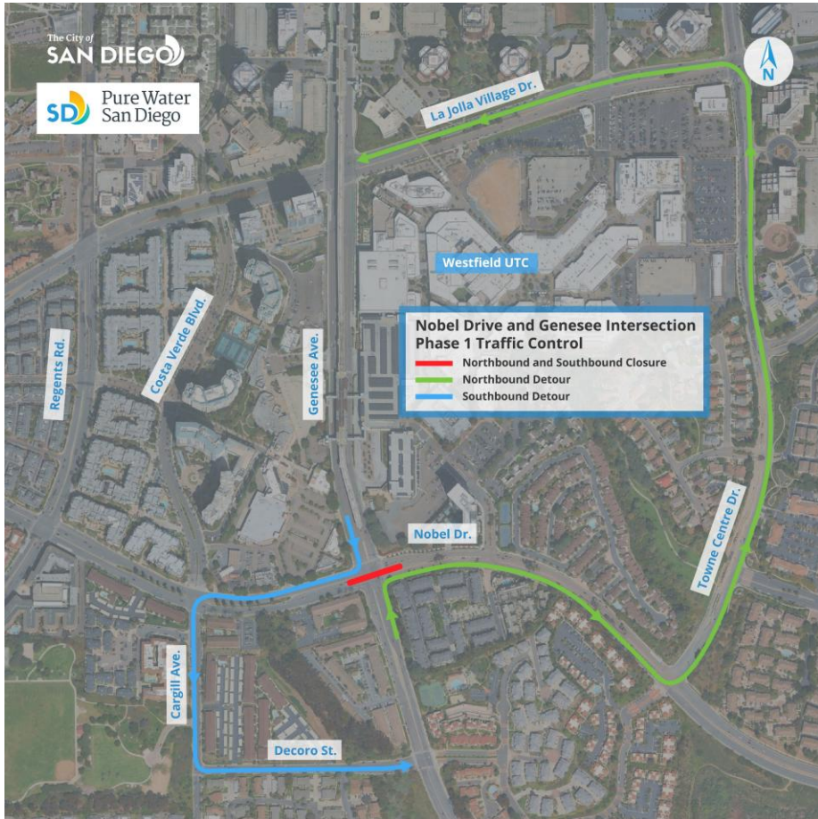
Phase 1 Traffic Control