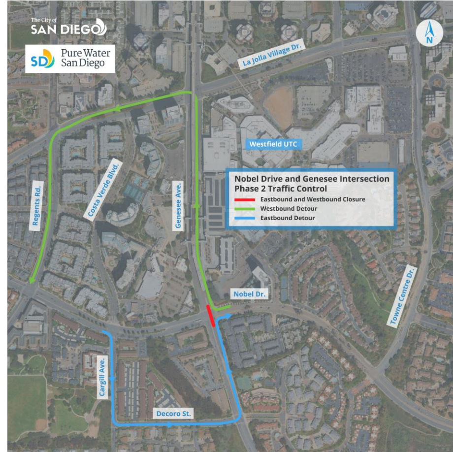
Phase 2 Traffic Control