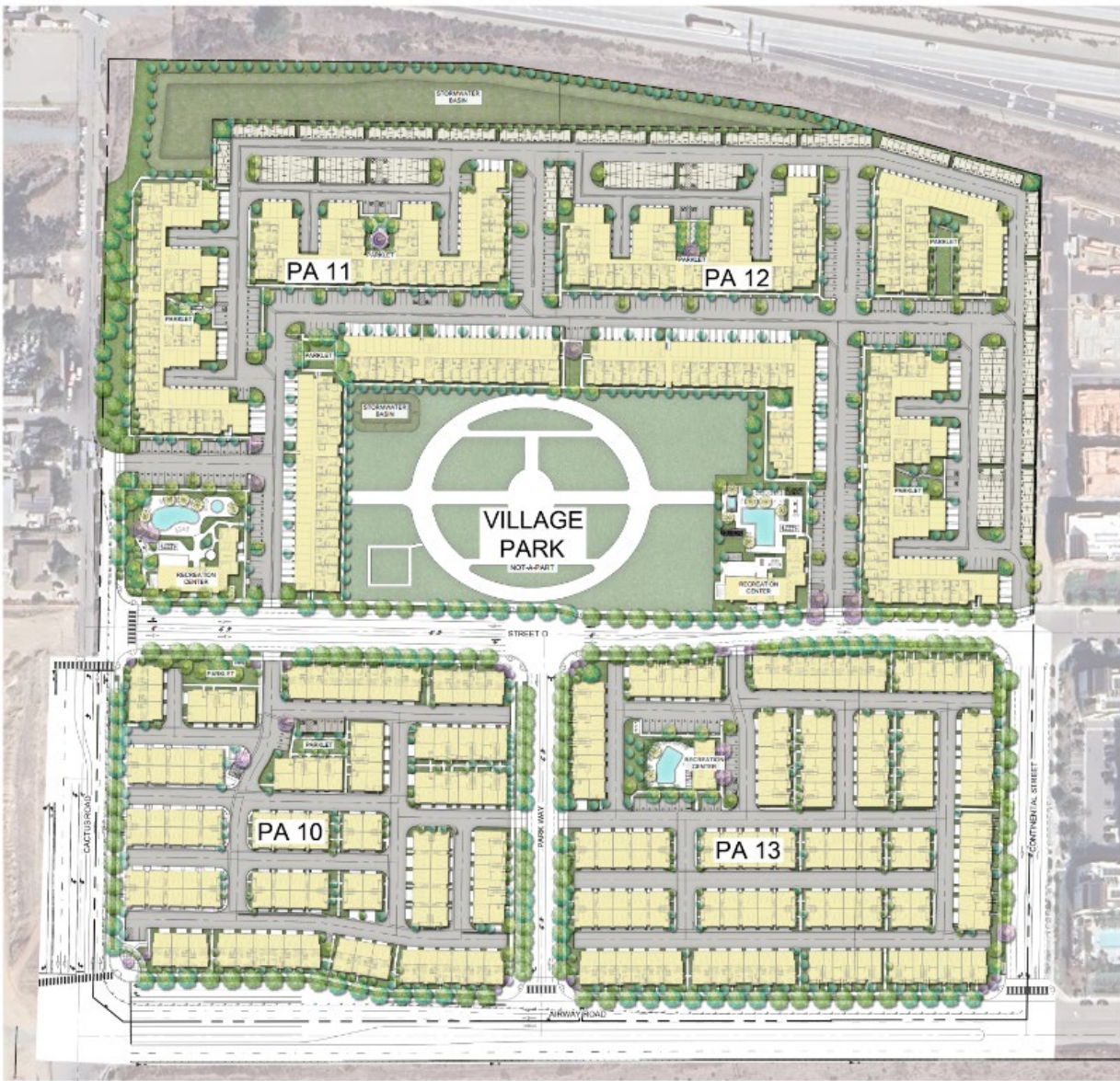
LANDSCAPE CONCEPTUAL RENDER