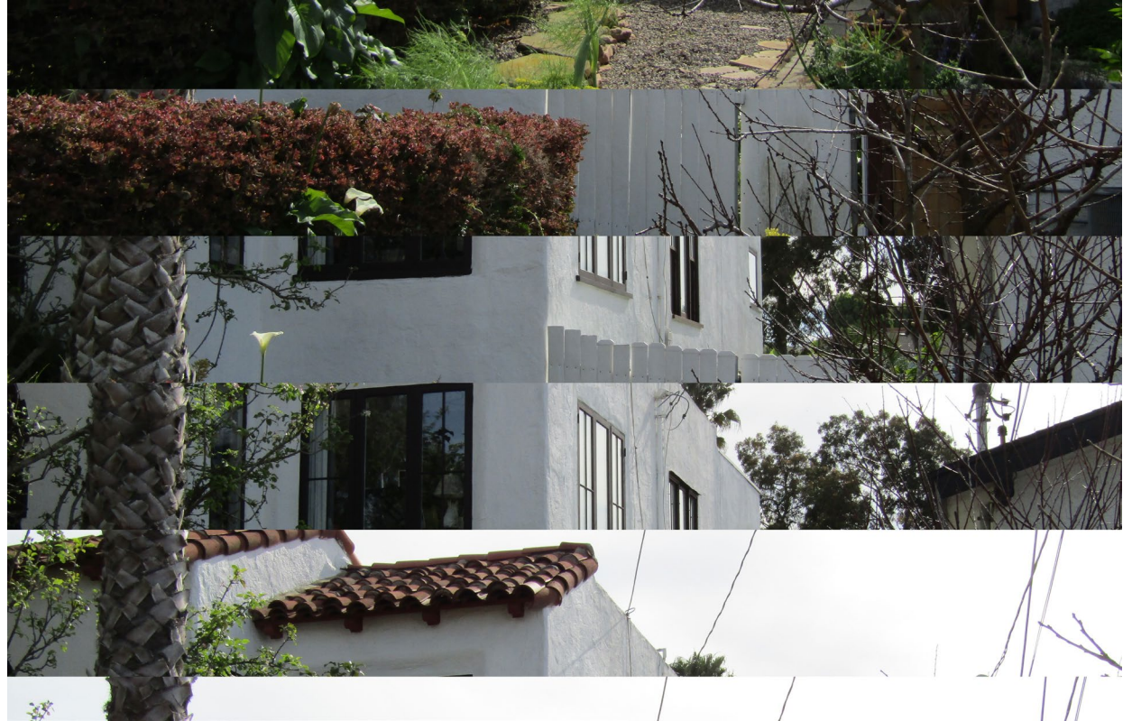
Side Elevation (E)