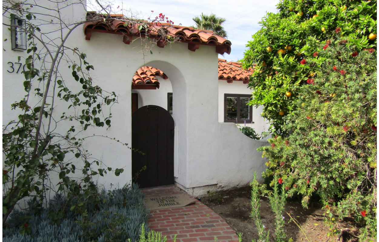
Side Elevation (W)