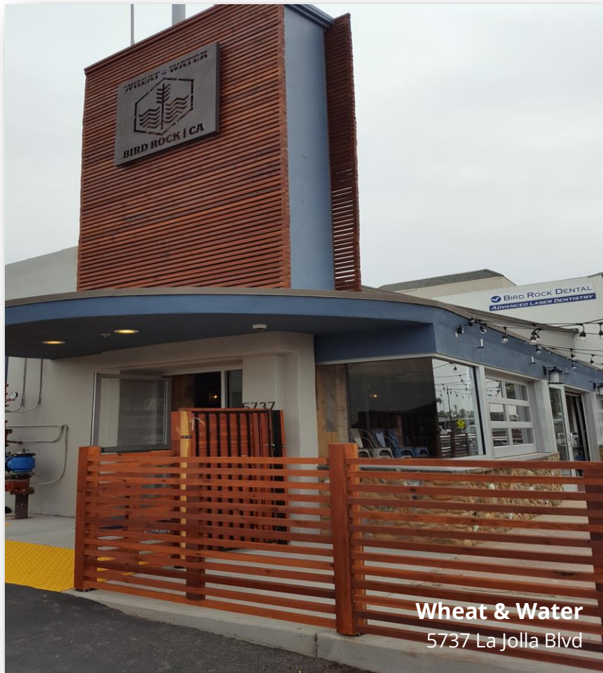
Wheat & Water 5737 La Jolla Blvd

The Storefront Improvement Program aims to revitalize neighborhoods by assisting business and property owners with projects that improve their building's curb appeal.