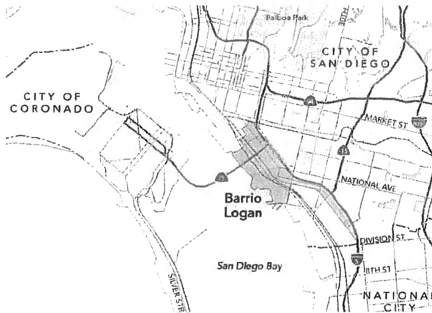
FIGURE 2-1 VICINITY MAP OF THE PLAN UPDATE

The Plan Update will establish goals and policies for future private development and public facilities improvements. Future development will implement the policies contained within the City's General Plan while enhancing the community for existing and future community residents, businesses and organizations.