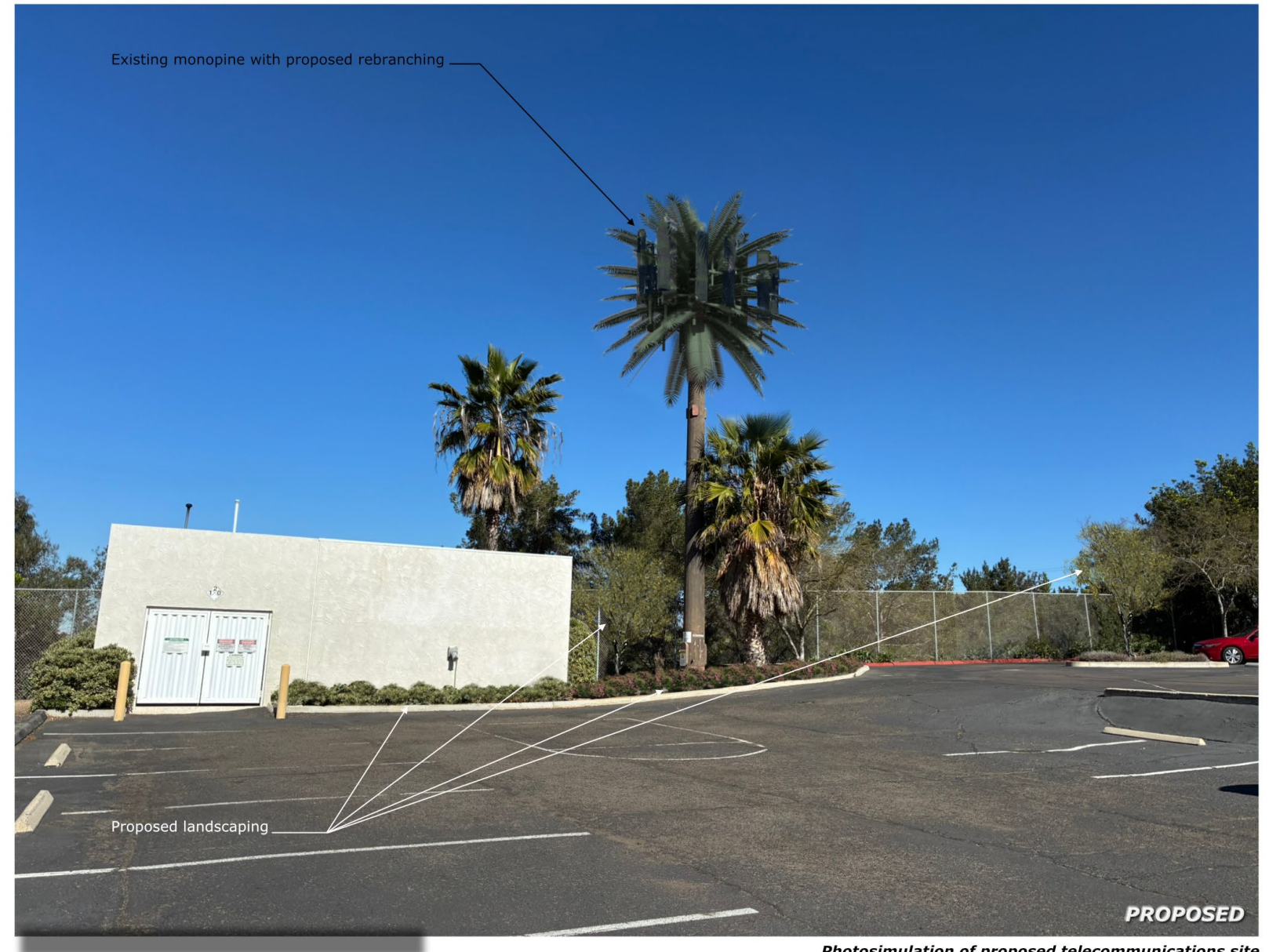
Photosimulation of proposed telecommunications site