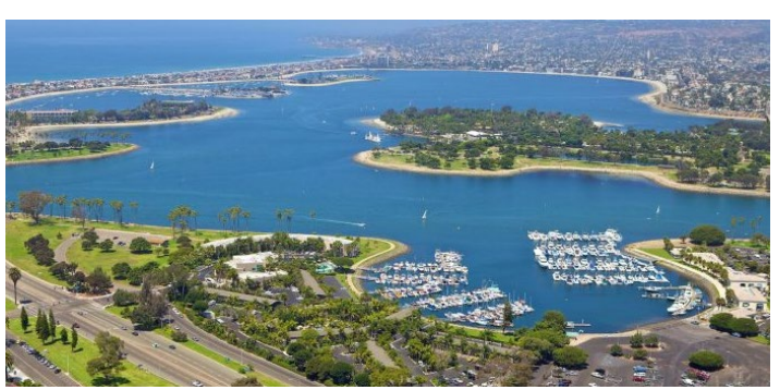
Mission Bay Park.

Finding 2: One member of the Mission Bay Improvement Fund Oversight Committee is serving beyond 8 maximum consecutive years in violation of the Municipal Code $26.30 (C) (4).