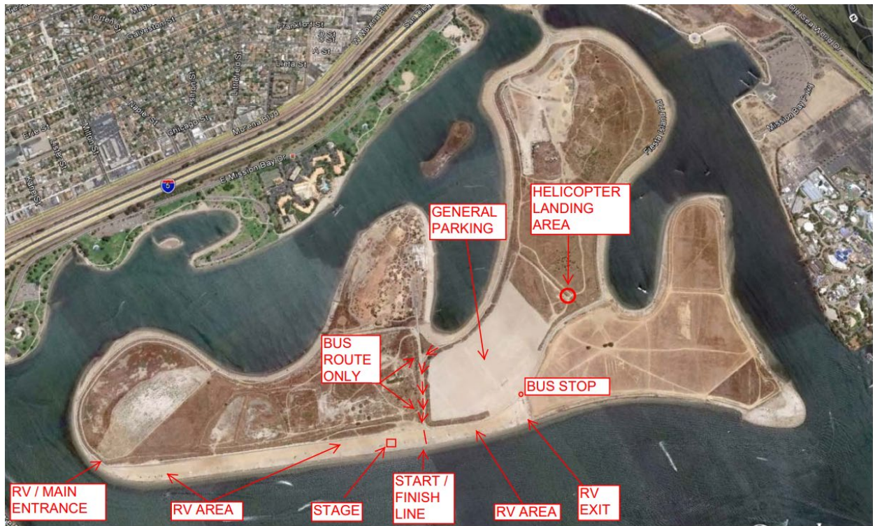
FIESTA ISLAND MASTER MAP