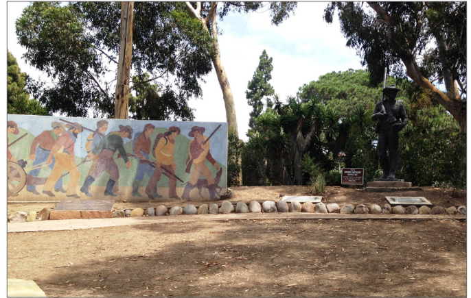
This mural is an example of public art in Presidio Park that commemorates the Mormon Battalion, which marched from Iowa to San Diego in 1846-1847 to help secure California for the U.S. in the Mexican-American War.