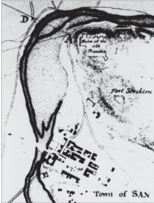
This map of Old Town in 1853 shows the location of Fort Stockton, the ruins of the Presidio, and Old Town's central plaza.

mixed ethnicity listed in the 1790 census included mulato and colores quebrado (both groups recognized as persons of African ancestry in the complicated Spanish colonial identity system), as well as other labels indicating some portion of African heritage.