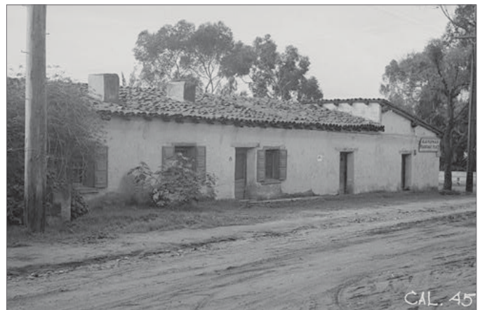
The Casa de Estudillo is one of the finest examples of the homes built during the Mexican Period.

Around this same time, soldiers and occupants of the Presidio began to move in increasing numbers off of Presidio Hill down to the flatter “pueblo” area, which approximates the Old Town San Diego of today. As the hide trade grew, so did the need for more grazing lands. Thus, the Mexican government began issuing private land grants within its Alta California territory in the early 1820s, creating the rancho system of large agricultural estates within San Diego County and northward. A large part of the land came from the former Spanish missions, which the Mexican government secularized in 1833.