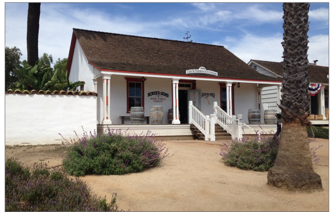
Casa de Pedorena is an adobe residence constructed by Miguel de Pedorena, who originally arrived in Old Town in 1838. This building was partially restored in 1968.

Property types associated with this theme may be individually significant under Criterion C if they embody the distinctive characteristics of a style, type, period, or method of construction. These buildings will possess the character-defining features of the style they represent. Single-family residences may be individually significant under Criterion B if they were the homes of persons significant in local history. A contiguous grouping of similar single-family residences from this period may be eligible for listing as a historic district under Criteria A-E.