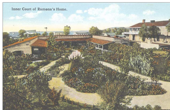
The Casa de Estudillo in Old Town became one of the community's first tourism destinations in the early 1900s.