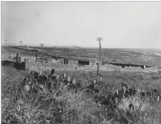
Old Spanish Cemetery/El Campo Santo, shown here ca. 1898, should be preserved and maintained as a designated historical site for the enjoyment of the public.

The Old Town State Historic District, added to the National Register of Historic Places in 1970, consists of the grouping of historic buildings and sites located within the blocks between Taylor Street, Twiggs Street, Congress Street and Juan Street.