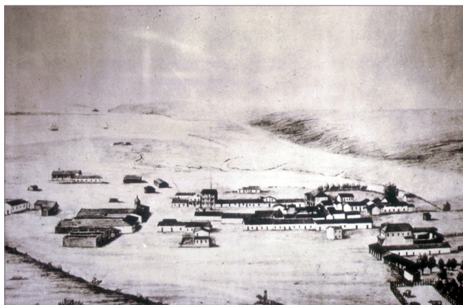
In this depiction of Old Town San Diego, multiple historic structures built around the central plaza can be identified.

Individuals from a diversity of ethnic and racial backgrounds were participants in the earliest days of Spanish colonialism in south Alta California. The presence of people of African descent in the San Diego area dates to the Hispanic settlers who founded the Presidio de San Diego in 1769. Although the Presidio was the first "European" community in California, these settlers and their successors reflected a multitude of racial backgrounds. Processes of intermarriage between individuals of Spanish, African, and Native American descent in Spain and in many areas of the Americas created a diverse population in early Spanish and Mexican California. Individuals originating from Cuba, the West Indies, and Africa played a significant role in the settlement and colonization of southern California. The complexities of definitions of identity in Spain and its New World colonies are clear in the 1790 census of the Presidio de San Diego. Of the 90 adults at the Presidio, at least 45 were noted as mixed blood. The categories identifying