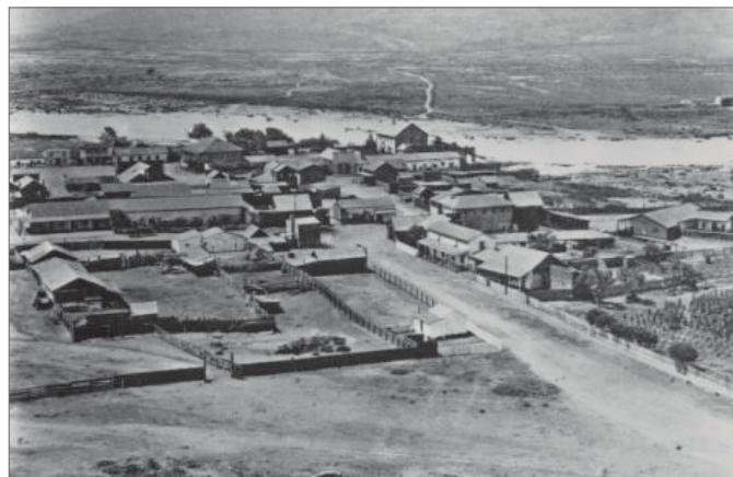
Old Town in 1868, with the San Diego River in the background.

The arrival of Alonzo Horton in 1867 and his subsequent investments induced a real estate boom and substantial development of New Town San Diego, which soon eclipsed Old Town San Diego in importance. Against considerable objection, City records were moved from the Whaley House in Old Town San Diego to the New Town courthouse in 1871.