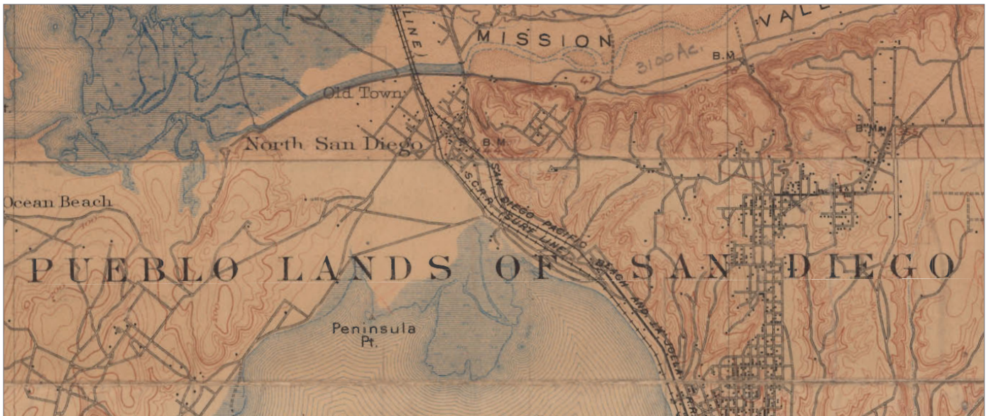
This 1904 USGS map shows Old Town’s grid street system, as well as the city’s early rail lines.

Development in Old Town during the early American Development and Industrialization period was slow prior to the expansion of the railroads. Some of the earliest buildings to be erected in Old Town during the American Period were “kit” buildings, built on the East Coast of the United States, shipped in sections around Cape Horn, and reassembled in San Diego. Development of a rail line was an integral component to Alonzo Horton’s vision of San Diego as a modern city and a major seaport. In 1885, the first transcontinental line arrived in San Diego. Once a transcontinental line had been established, trade