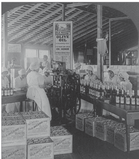
The Old Mission Olive Works Company processed olives from Mission Valley in the Casa de Bandini and later in a Mission Revival style packing plant at Taylor Street and Juan Street.

In Old Town there were two distinct periods of development directly influenced by tourism and preservation. The first phase occurred from 1904 to 1939 and revolved around the impact of the automobile. This phase was characterized by early motorists' interest in buildings remaining from the Spanish and Mexican Periods in Old Town. The second phase from 1950 to 1970 was characterized more by the restoration, reconstruction, relocation, and recordation of existing resources that became tourist attractions in the first phase.