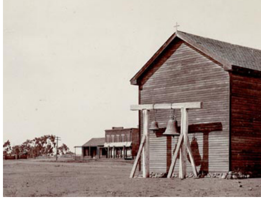
Old Town, San Diego, Cal. 1885.