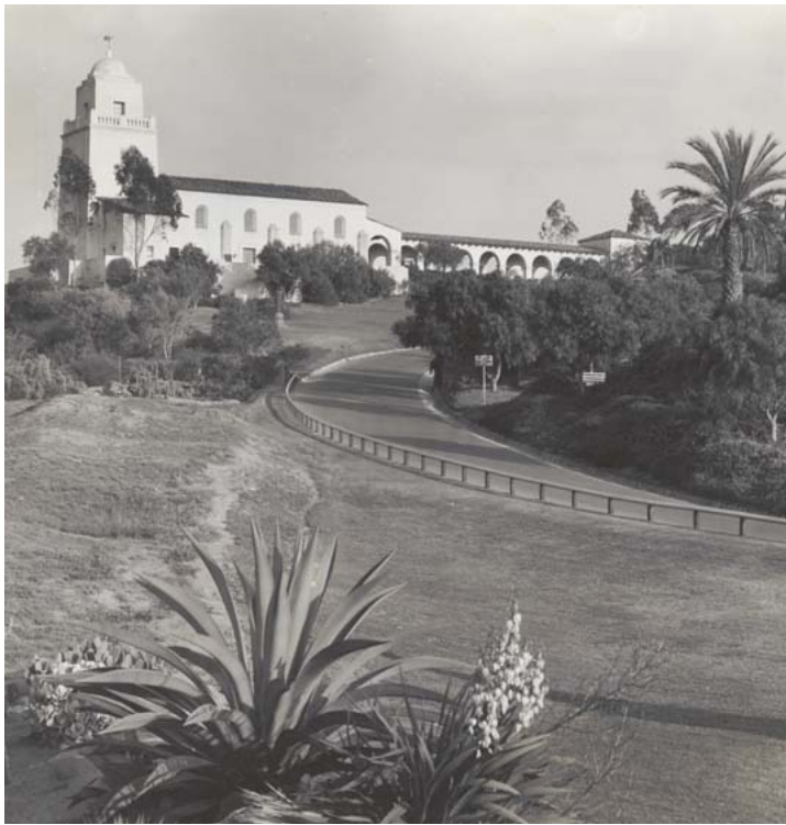
Junipero Serra Museum.