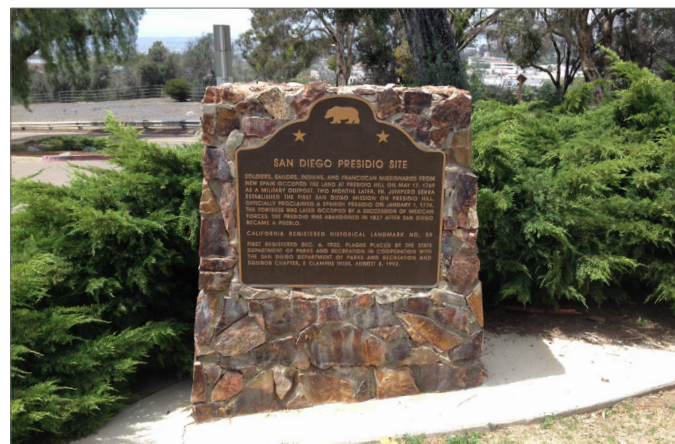
The San Diego Presidio Site (HRB Site #4) commemorates two important events: the founding of the first permanent European settlement on the Pacific Coast of the United States and the establishment of the first mission in California by Father Junipero Serra in 1769.