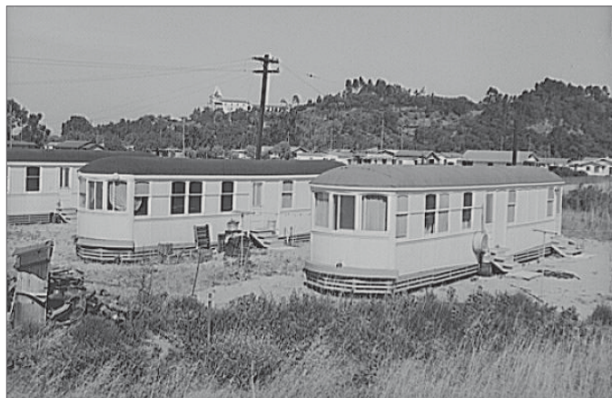
Streetcar dwellings near Old Town in 1941 provided housing for an influx of defense workers.

In the mid-1930s, San Diego's economy began to recover and in October 1935, the city received a huge industrial economic boost when Reuben H. Fleet relocated his Consolidated Aircraft company to the Midway area, just southwest of Old Town. As the economy began to recover commercial development in Old Town resumed to accommodate additional auto-oriented tourism.