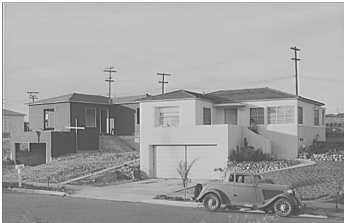
FHA Housing of the "Small Houses" type, similar to the homes in the Mason Sub-District, 1941.

The properties identified by the Historic Resources Reconnaissance Survey are protected and preserved to some degree through existing General Plan policies and the historical resources regulations and guidelines of the Municipal Code. Additional policies that address the identification and preservation of new historical resources in the Old Town community follow.