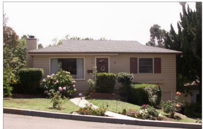
Single-family residences built in the Minimal Traditional style were built below Presidio Park along Sunset, Mason, Twiggs and Jefferson Streets.

According to Sanborn maps, property types associated with this theme include the adaptive re-use of tourist motor courts, auto courts, and even old trolley cars as temporary housing for the influx in defense and military personnel. However no examples of this type of temporary housing remain. In addition to temporary residential accommodations, permanent single-family residences were constructed. A concentrated pocket of single-family residences constructed during this time is still present just below Presidio Hill. The single-family residences constructed during this period are concentrated below Presidio Park along Sunset, Mason, Twiggs and Jefferson Streets. The majority of the homes were designed in the Minimal Traditional style with a few