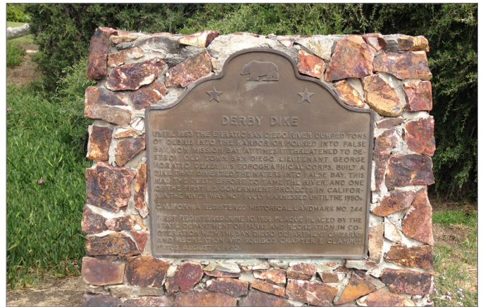
Historical markers and plaques such as this one identifying the Derby Dike site commemorate important events and places in the history of San Diego.