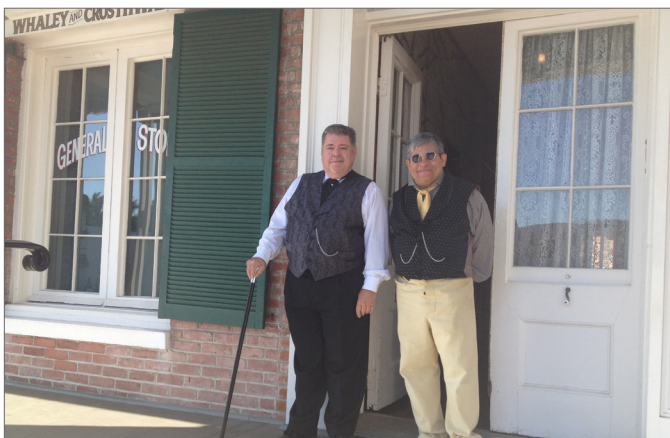
The Whaley House Museum offers residents and tourists the opportunity to learn more about Old Town's history.

There are a number of incentives available to owners of historic resources to assist with the revitalization and adaptive reuse of historic buildings and districts. The California State Historic Building Code provides flexibility in meeting building code requirements for historically designated buildings. Conditional Use Permits are available to allow adaptive reuse of historic structures consistent with the U.S. Secretary of the Interior's Standards and the character of the community. The Mills Act, which is a highly successful incentive, provides property tax relief to owners to help rehabilitate and maintain designated historical resources. Additional incentives recommended in the General Plan, including an architectural assistance program, are being developed and may become available in the future.