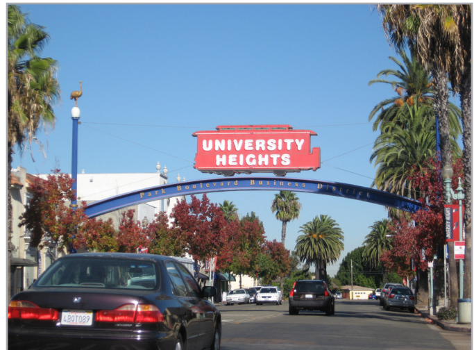
The University Heights – Park Boulevard Business District is shared by both the North Park and Uptown communities.