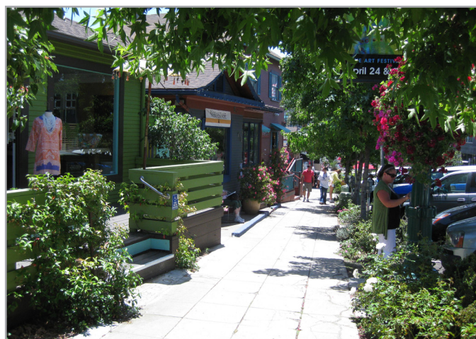
Street trees and landscaping can be a major economic generator for commercial districts by attracting pedestrians.