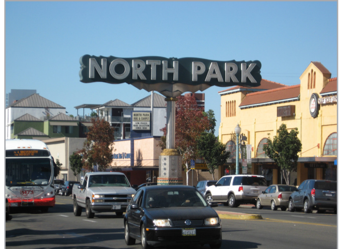
The North Park community has the benefit of having four business district organizations looking after the success of its commercial areas.