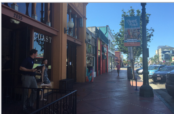
North Park's commercial areas provide pedestrian-oriented storefronts.

The historic resources in North Park provide a sense of place. Throughout the Economic Prosperity Element there are policies that relate to the historic resources in North Park. North Park contains multiple designated historic resources and 4 designated historic districts – Shirley Ann Place, University Heights Water Storage and Pumping Station, and the Burlingame and North Park Dryden neighborhoods. Refer to the Historic Preservation Element for more information about historic resources in North Park and designated and potential historic districts.