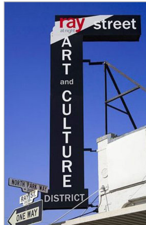
The growth and popularity of North Park's art, culture, and entertainment district has been major a contributing factor in North Park's revitalization.