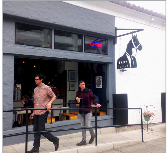
Older buildings can be retrofitted to create new indoor-outdoor experiences.