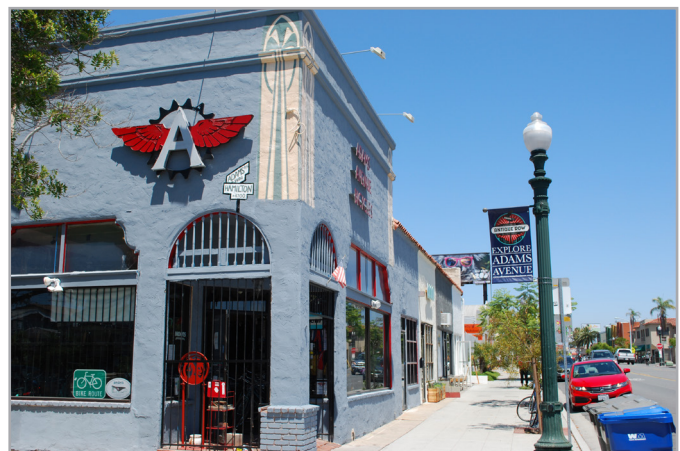
The Adams Avenue Business Improvement District which runs through Normal Heights, Kensington, Antique Row, and University Heights annually plays host to the Adams Avenue Street Fair and Adams Avenue Unplugged which are the City's largest free music festivals.