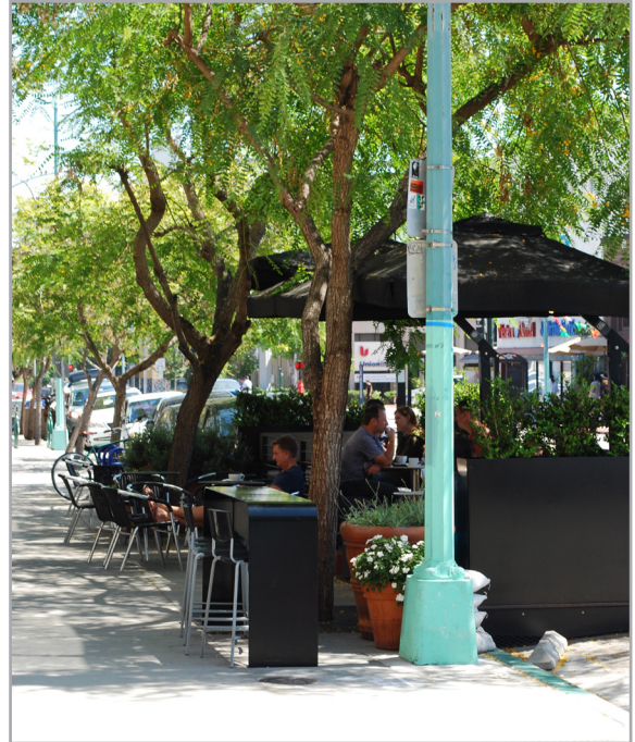
Parklets are an innovative way to transform parking into unique gathering spaces within commercial districts. The City's first parklet is located at 30th Street and University Avenue.