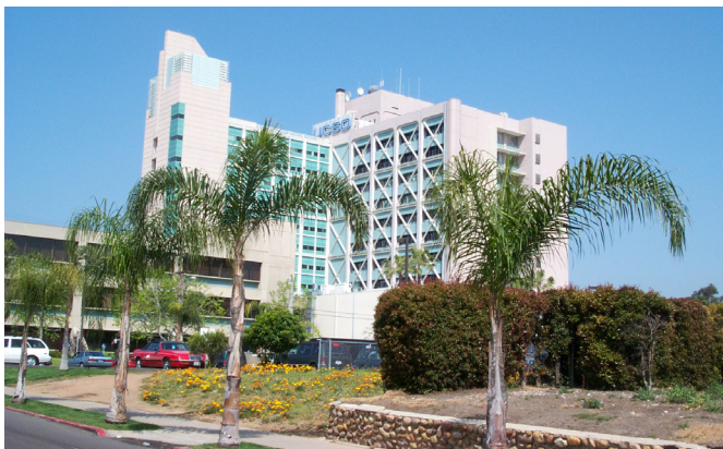
UCSD Medical Center is one of the largest employers in the Uptown Community.