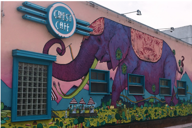
Public art can add a level of culture to commercial areas and is a typical element in successful business districts.