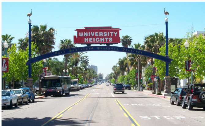
Maintenance assessment districts provide special benefit services that could include installation or maintenance of open space, street medians, street lighting and mini parks.

A BID works to unify the businesses within a particular district to work toward a common goal of economically revitalizing their business district. This is typically done through marketing programs, civic beautification projects, commerce recruitment, and parking and transportation improvements. Current, economic development strategies that all BID associations provide are: organized special events, social media marketing, and membership communication.