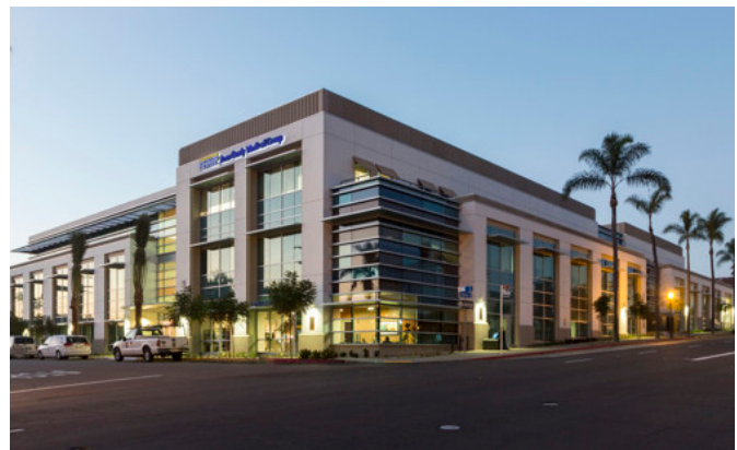
Medical and general uses are located along the major north-south corridors of Bankers Hill/Park West neighborhoods.