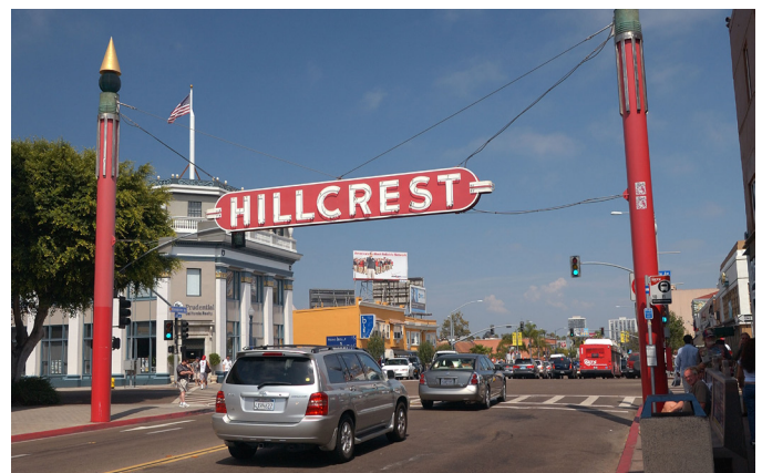
The Hillcrest Business Improvement District is the most prominent business district in the Uptown community.