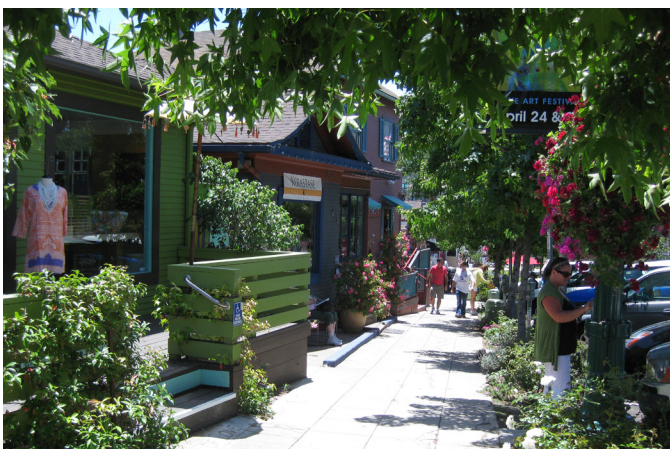
Street trees and landscaping attract pedestrians and help support vibrant commercial districts.

The New Markets Tax Credit (NMTC) Program is a federal tax credit program that promotes investment in businesses and community facilities located in low-income communities. In exchange for a qualified equity investment, pursuant to the NMTC program requirements, an investor is provided a tax credit. The proceeds of the equity investment are utilized to fund low-income community businesses located in qualified low-income census tracts. For more information see Civic San Diego's Program - New Market Tax Credits.