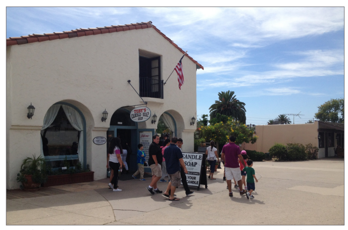
Retail, goods and services uses can foster engagement with the community while supporting businesses and artisans.