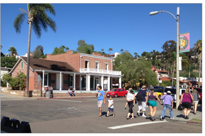
Old Town's historical resources and ambiance draw visitors and locals to the community's attractions and businesses.