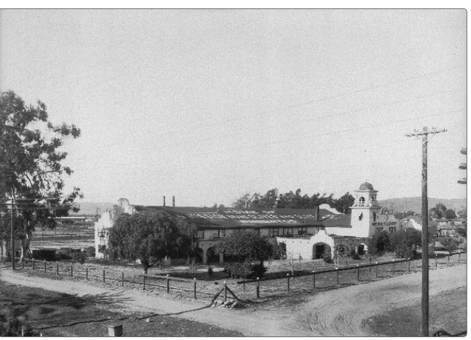
Old Town San Diego's history and character have long made it an attractive location for businesses including the Old Mission Olive Works Company, seen here in 1928.