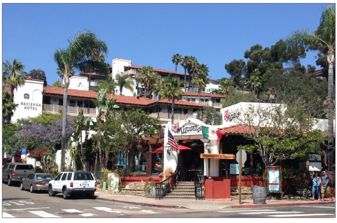
Well-designed visitor-serving uses including hotels and restaurants support heritage tourism and generate sales and employment.

As the birthplace of California, Old Town San Diego is rich with historical and cultural heritage and plays an important role in the City's tourism industry. Old Town has been a center for cultural heritage tourism and related businesses since the 1930s. Tourists continue to travel to Old Town to experience places and activities that authentically represent the stories and people of the past and present, including irreplaceable historical, cultural, and natural resources. Heritage tourism also generates support for and enhancement of the community's historical character, preserves historical resources, and creates destinations for tourists and local residents. Visitors are attracted by the quality historical and cultural buildings and sites, period architecture and landscaping, museums, and parks.